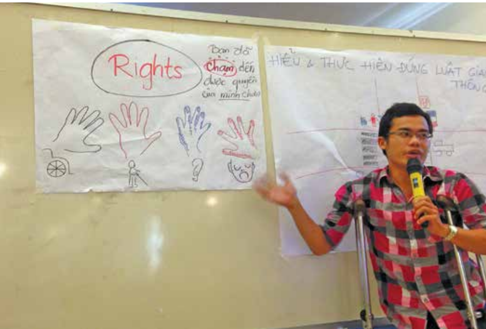
Each group presented its work to the class.