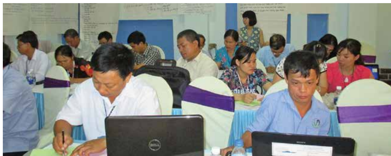
Individuals spent time identifying the problems their organizations face to support the implementation of Vietnam’s National Law of Person’s with Disabilities so they could design marketing materials designed to address those problems.

Another reason behind the law’s slow implementation is lack of pressure from PWDs and their families. People in