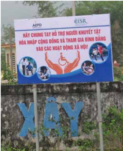
Concepts developed in the classroom were used to create billboards, pamphlets and other marketing materials.

the law's enforcement as a fundamental means of improving inclusion of PWDs into Vietnamese society. Participants then took part in group exercises to plan specific actions to implement provisions of the law in their home provinces.