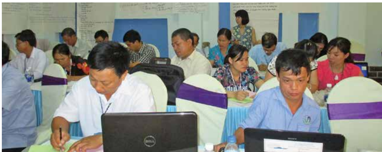
Individuals spent time identifying the problems their organizations face to support the implementation of Vietnam’s National Law of Person’s with Disabilities so they could design marketing materials designed to address those problems.

Another reason behind the law’s slow implementation is lack of pressure from PWDs and their families. People in