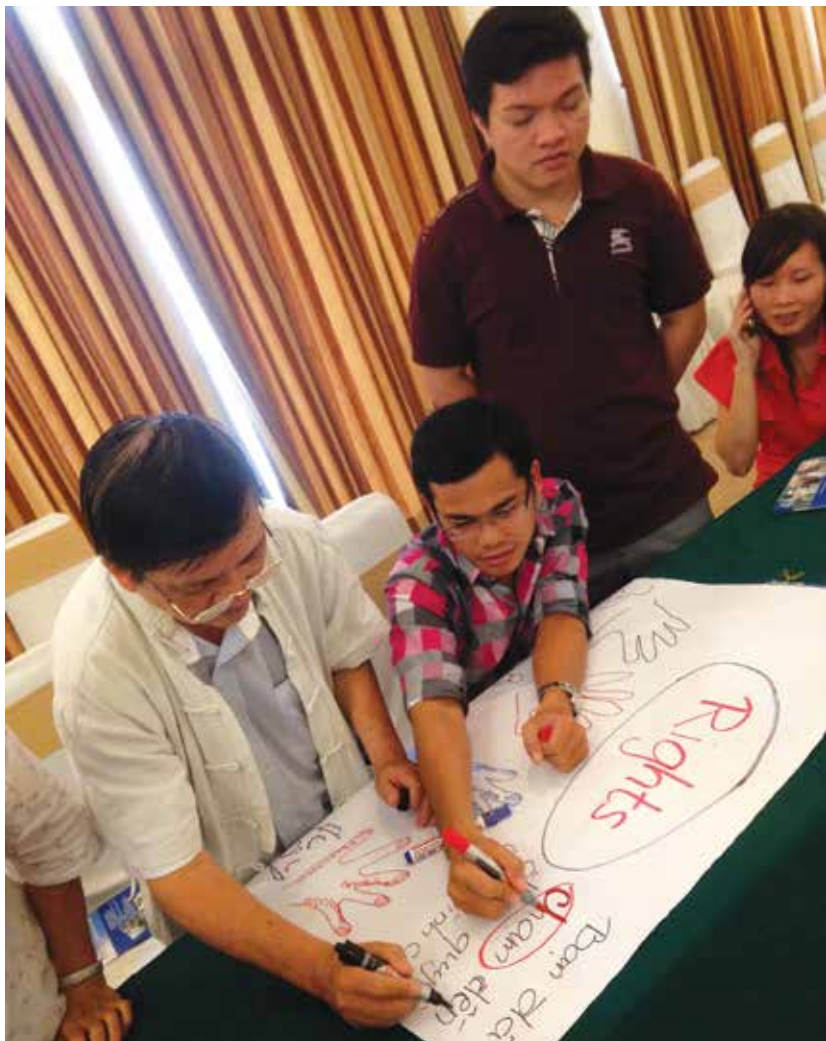
Training included small group activities to develop ideas for marketing materials.

The Vietnam War (1954–1975) lasted over 20 years and left hundreds of thousands of Vietnamese with physical and psychological injuries. Although disabled veterans receive many privileges and benefits in Vietnam, most persons with disabilities (PWD) continue to face employment discrimination and lack of access to health care, transportation, education and vocational training. The exact number of PWDs living in Vietnam is unknown. A 2009 U.N. Population Fund survey found 6.1 million Vietnamese with one or more disabilities including an unknown number with neurological and genetic effects from Agent Orange, a defoliant used to uncover Viet Cong bases and supply lines during the war. 1,2 Those affected by Agent Orange often rely on mobility devices such as crutches or wheelchairs, but streets, sidewalks, buildings and bathrooms in Vietnam are rarely accessible. 3 Many PWDs also live with visual, auditory or intellectual disabilities, yet Vietnamese schools have few teachers trained to work with children with disabilities, and courses in Braille or sign language are almost nonexistent.