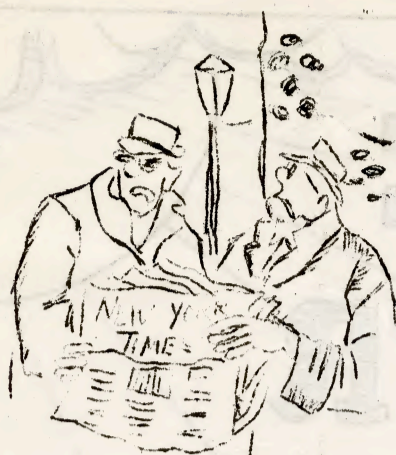
WFFS THE MILITANT FINANCIAL HERALD