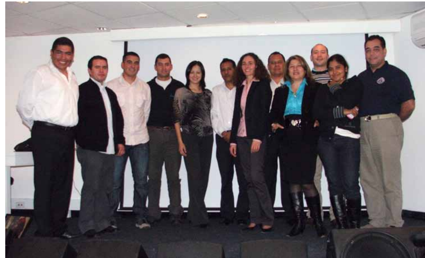
IMSMA NG administrators from Chile, Colombia, Ecuador and Peru at the Level A1 training in Bogotá, October 2010.

For a number of years this training method proved effective for IMSMA Legacy systems. However, IMSMA