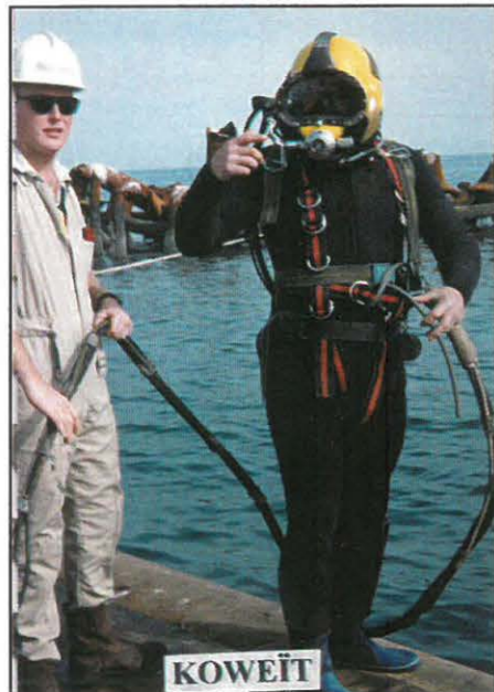
Many countries utilize Geomine's deminers, as they possess the technology and skill to neutralize UXO in all situations.

Together, these two companies have established a competent organization capable of neutralizing all types of UXO in all potential situations. Geomines has successfully completed missions in Bosnia, Cambodia, El Salvador and Egypt, among other places.