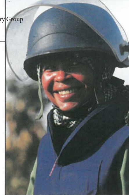
MAG's work provides benefits to its staff and the local community in addition to the removal of mines and UXO from their land. The wages that the staff earn working for MAG will usually go to support an extended family. This money promotes the economic efforts of the broader community.