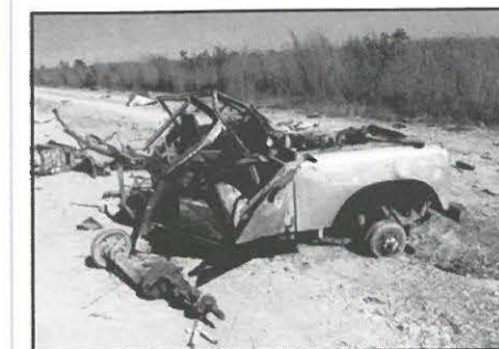
Nineteen civilians were killed when this Land Rover taxi drove over an anti-tank mine.

The Russian army has relied heavily on extensive bombardments in both the current and previous war with the Chechen forces. Air-dropped AP mines and wide mine fields around military positions hold the small country hostage. In 1997, HALO surveyed 286 mined areas and was demining these areas with over 150 Chechens, but this and other programs had to be abandoned in December 1999, because of the fighting.