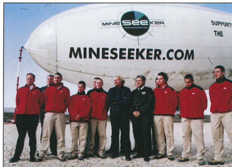
The Mineseeker crew.

as the radar was able to detect surface metal and plastic mines with at least the accuracy of ground level surveying. With aerial survey, the team detects and maps mines and UXO, including plastic mines as small as 10 cm. The Mineseeker was found to be able to scan an estimated 100 sq. m per second, a dramatic increase from the amount of land that can be covered per second during typical ground survey. By using aerial survey, large areas can be mapped in a short time and mine-free land can then be released for use, eliminating the need for an actual physical search.