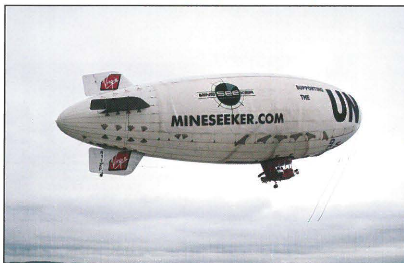
Mineseeker Airship in flight.