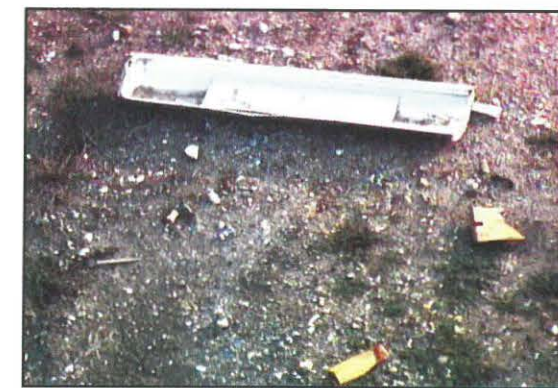
The canister from a cluster bomb strike identified from 1,000 feet.

to promote public awareness of the Mineseeker in Kosovo through a three-part campaign. The team used a three-part method to promote public awareness. The first part was getting local television and radio coverage in the areas of surveying. The media explained that the Mineseeker was there for mine survey and not any type of military action. The second part consisted of sending a mine awareness team to speak with local people to reinforce the positive nature of the project. The third part involved conversing with village elders and inviting them to look at the airship and equipment on the ground at its base. This gave the people a chance to