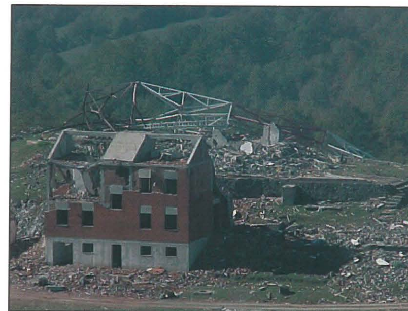
Post conflict battle damage can be assessed for UXO risk, and associated mined areas pinpointed using aerial images and provided military records. c/o The Mineseeker Foundation

The second phase of the survey was a testing period for the prototype