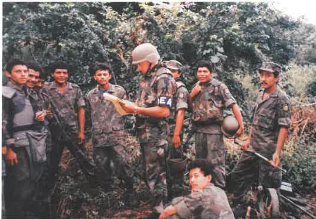
The Inter-American Defense Board visits a minefield in a Nicaraguan border area, 1993.

assistance it offers. For years now, it has warned hundreds of thousands of inhabitants of the threat of landmines, cleared hundreds of minefields and returned the much-needed "mine-free" land to inhabitants. Additionally, the program has assisted mine victims in every step of their rehabilitation and assisted countries in the destruction of their stockpiled mines and in complying with their obligations stated in the Ottawa Convention. Although the goal of the OAS—a "mine free" 22 hemisphere—is an achievable one, there is still a long road ahead. It is important to point out that while the regional approach to mine action has provided a number of benefits to the OAS member states, it is the national will and support that has made these programs flourish