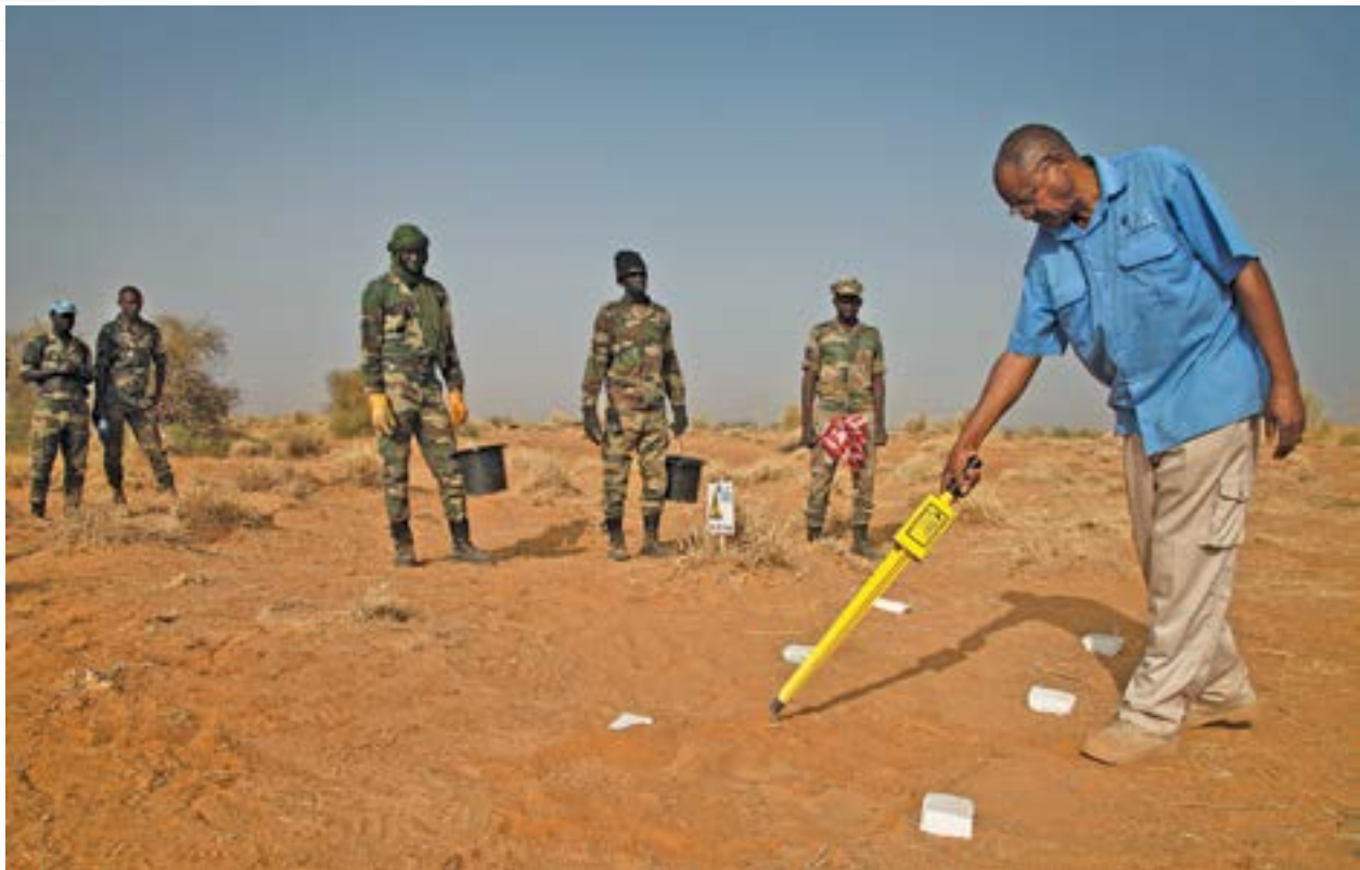
UNMAS assesses explosive threats at a future MINUSMA campsite in Gao, Mali, February 2014.