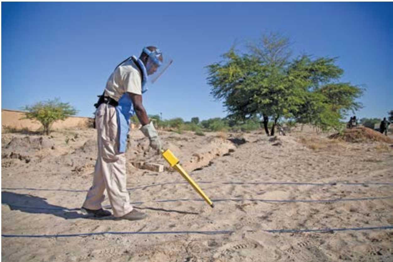
An operator with The Development Initiative uses a magnetic locator to conduct battle area clearance activity at the Malian army camp in Timbuktu, December 2013.