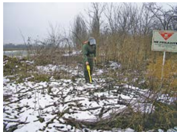
The Croatian Mine Action Center (CROMAC) employed the Schonstedt GA-72Cd locators on clearance projects along the power line in eastern Croatia near the Osijek city in very difficult terrain.

Schonstedt locators have contributed to clearance operations in numerous countries. For instance, the Tajikistan Mine Action Centre reported finding complete cluster bombs, each containing hundreds of submunitions. Most were broken open and their contents relocated down the mountain. In one gully, ten submunitions were found by eye, while another seventeen were found using the donated detectors. And as reported by the Mine Action Programme for Afghanistan (MAPA) and The HALO Trust, over 80 tons of ammunition