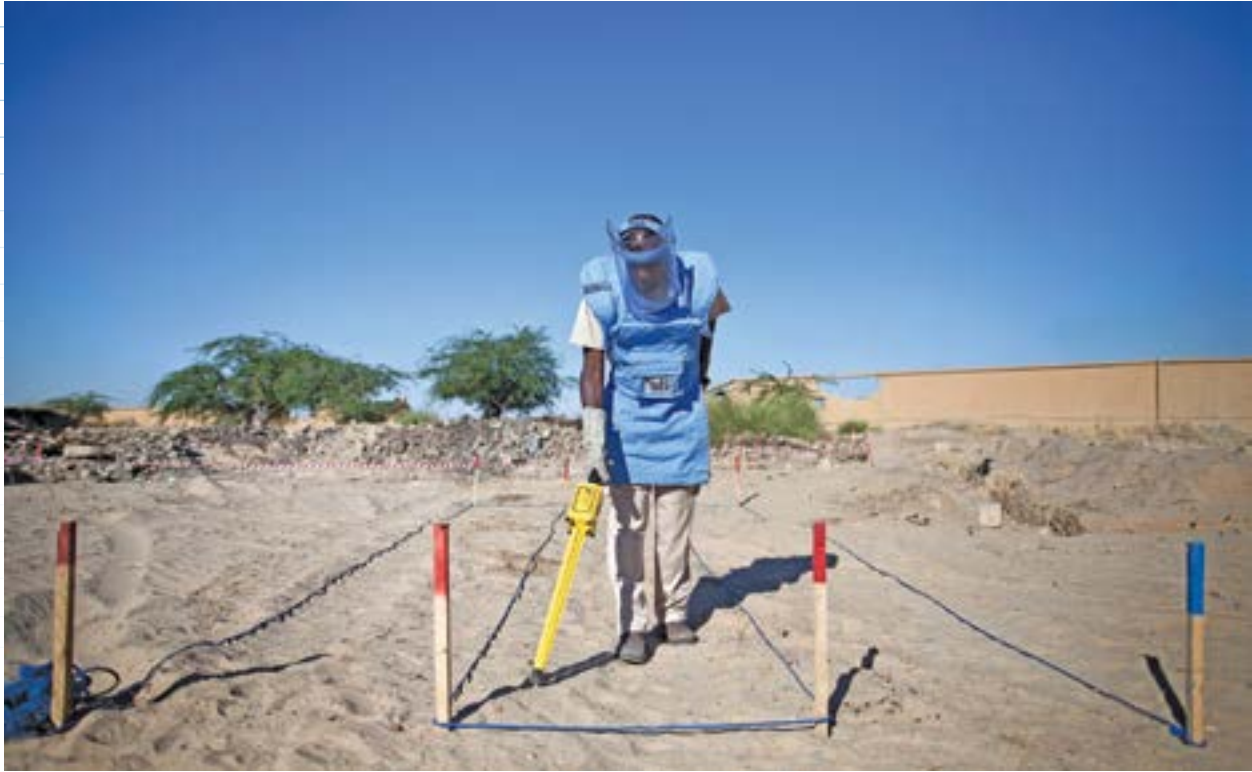
UNMAS assesses explosive threats at a Malian army camp in Timbuktu, December 2013.