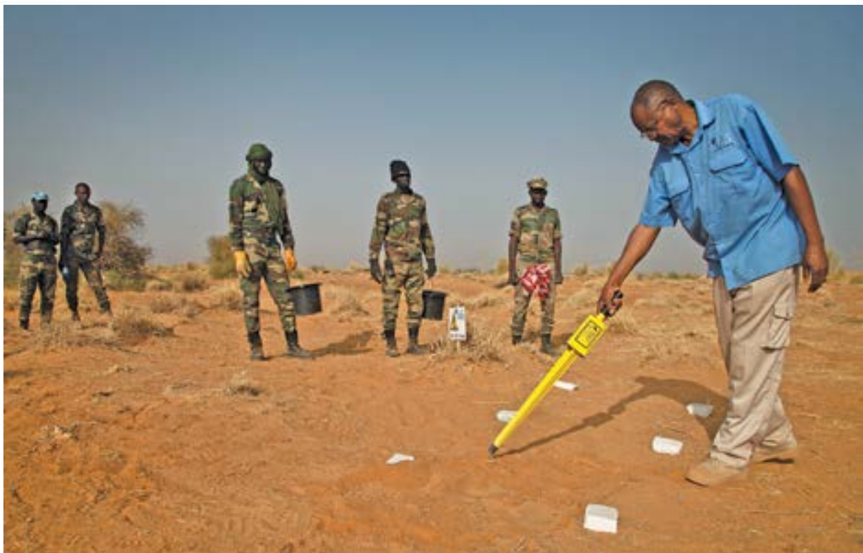
UNMAS assesses explosive threats at a future MINUSMA campsite in Gao, Mali, February 2014.