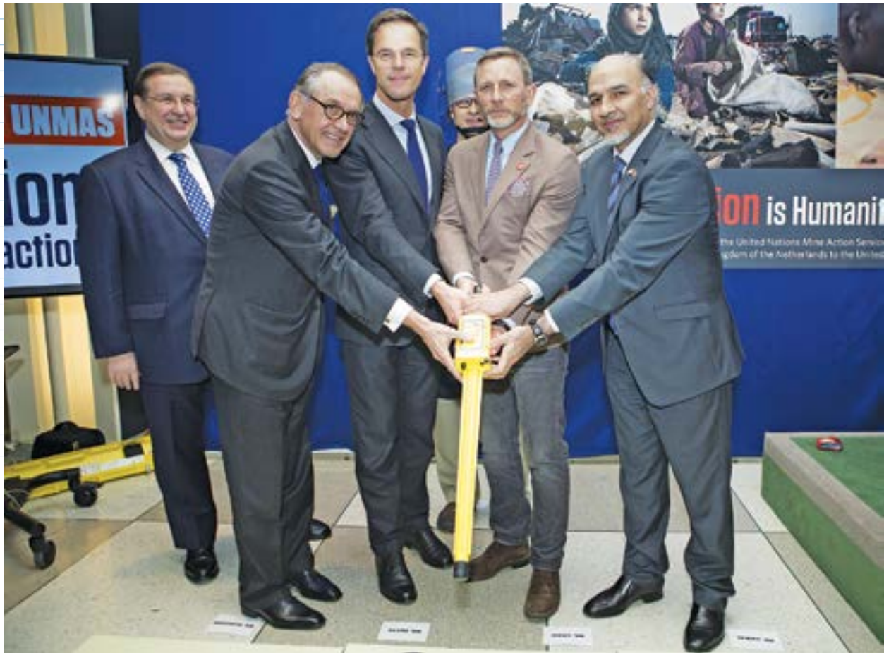
Daniel Craig, U.N. Global Advocate for the Elimination of Mines and Explosive Hazards, demonstrates the use of the Schonstedt magnetic locator.