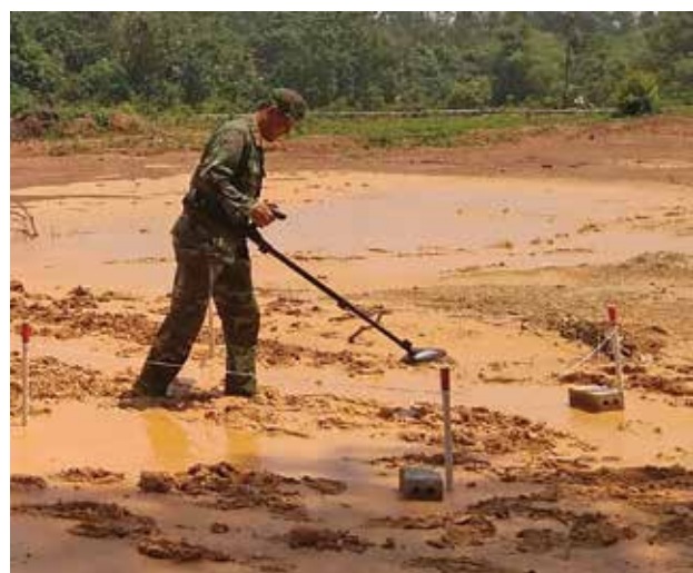
A Vietnam People's Army soldier conducts mine detector practical training with their new training equipment provided by the U.S. Department of State and Department of Defense during phase one of humanitarian mine action training in August 2016. Golden West Humanitarian Foundation was a key advisor on equipment purchases.

The most recent iteration of our partnership with Golden West—a two week mentorship session in Quang Tri Province—integrated VNMAC students with two teams that had already been trained through IMAS Level 2 by Golden West. VNMAC personnel trained in the field to learn how to conduct battle area clearance (BAC) and live unexploded ordnance (UXO) disposal from their Golden West-trained counterparts. Two soldiers from the 74th ORD CO participated in this training. Observing this live training with the Vietnamese allowed our soldiers to impart their knowledge directly into the Vietnamese standard operating procedures. It also gave our soldiers insight into exactly where we need to amend our curriculum so that VNMAC trainers can mesh directly into future operations with their countrymen and Golden West. Soldiers of the 74th continued into a Golden West-taught IMAS Level 1 course to better understand how to properly teach the course material. Although this step should have taken place before our initial IMAS Level 1 course in August 2016, it provided invaluable insight for future iterations.