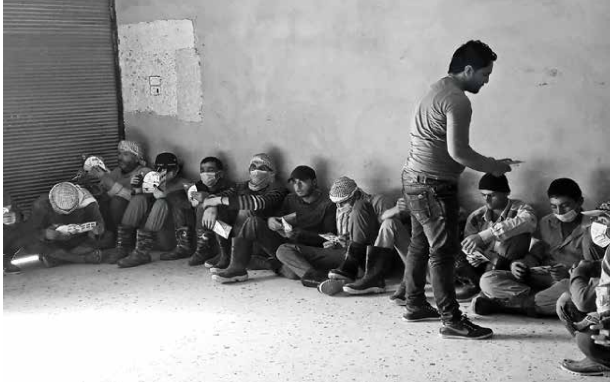
Risk education to rubble clearers in northern Syria, 2016.