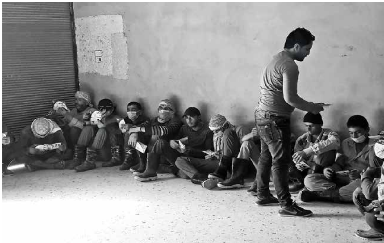
Risk education to rubble clearers in northern Syria, 2016.