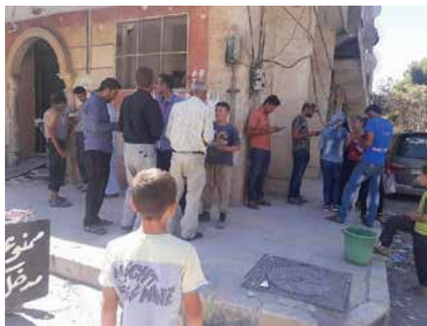
IED risk education to recent returnees in northern Syria, 2016.

Analysis of explosive contamination resulting from the conflict in Syria has shown that the types of explosive weapons used are varied and include landmines, various ordnance (e.g., artillery), cluster munitions, booby traps, and IEDs. 2,3