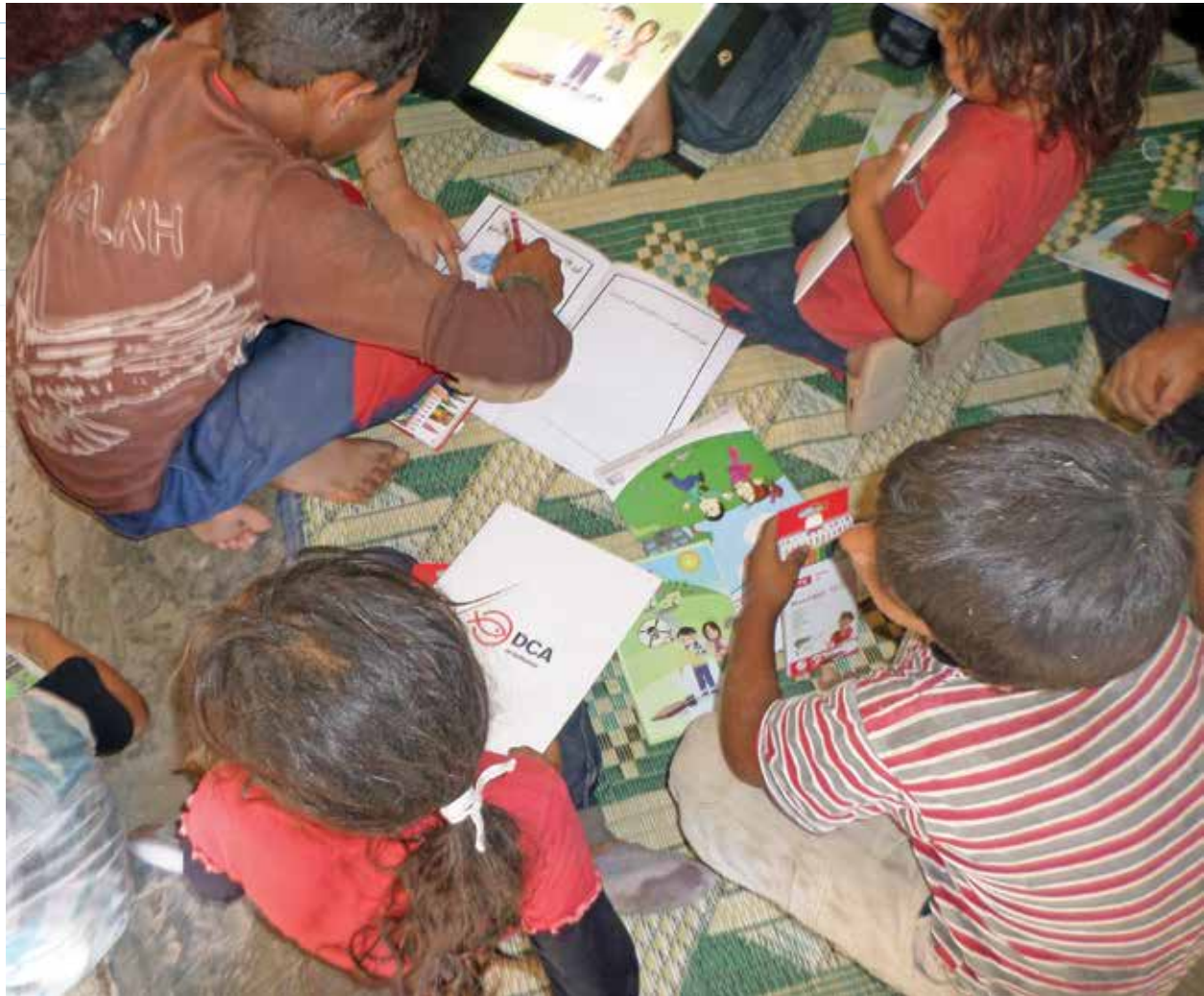
Risk education to children in northern Syria, 2015.

urgency for displaced populations in Syria wishing to return to their homes as soon as they perceive it safe to do so.