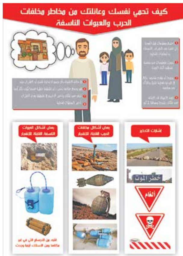
Figure 2. Adult returnee poster.

target adult returnees. The explosive threat posed to civilians in Syria involves landmines, unexploded ordnance (UXO), booby traps, and IEDs, or a combination of these explosive items; as a result, risk education materials targeting adult returnees have been designed to include all explosive threats. As seen in Figure 2, the different categories of explosive items are distinguished on the poster. Considering the limited time and opportunities that were available to target those returning home, this was considered the most efficient and effective approach to raising awareness about the threats posed by explosive hazards.