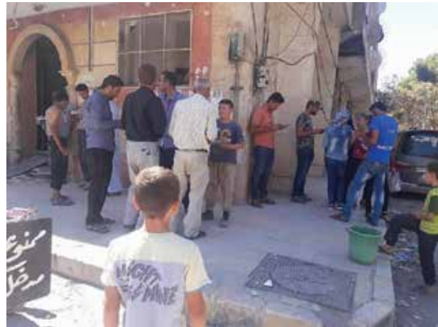
IED risk education to recent returnees in northern Syria, 2016.

Analysis of explosive contamination resulting from the conflict in Syria has shown that the types of explosive weapons used are varied and include landmines, various ordnance (e.g., artillery), cluster munitions, booby traps, and IEDs. 2,3