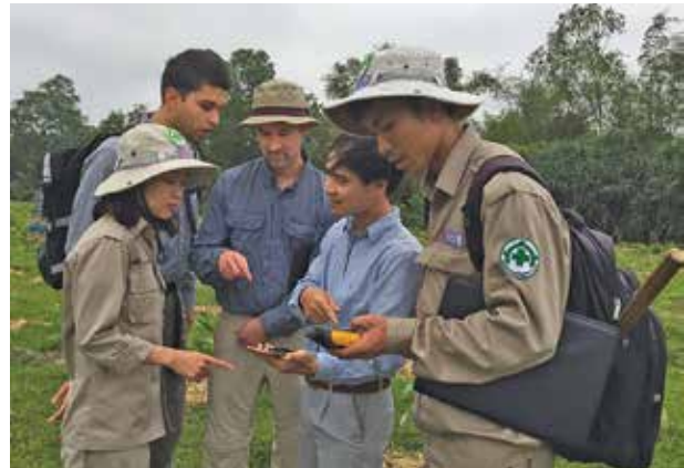
Survey and IM personnel with JMU/CISR comparing traditional vs. mobile data entry during the CAST pilot phase in Vietnam.

Mine action centers and implementing partners have varying systems for investigating, reporting, and remediating suspected hazardous areas. Non-technical and technical surveys have different SOPs and accuracy requirements. If one were to describe field survey in simplistic terms: teams survey areas and document the geographic location and relevant information about their survey on paper notes and/or forms in the field, and then ultimately enter the data into electronic forms or databases from the office. The timeframe in which the data is migrated from paper to electronic forms or databases depends on, but is not limited to, the results of the field surveys and program-specific QA/QC protocols. Later, information management personnel use the electronic database to harvest data back out into GIS desktop platforms for mapping, analysis, planning, or reporting. This system works and is successful, as evidenced by the many mine action programs effectively using these methods around the world. Despite this success, there are some common drawbacks with this method,