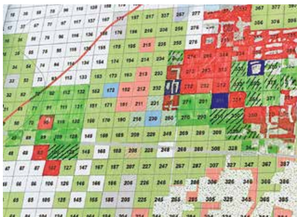
Figure 1. Example of a hand-shaded survey task map.

order to maximize the potential of this technology, programs can integrate GIS on the front-end for planning as well. Then, promptly synchronized GIS data can inform: