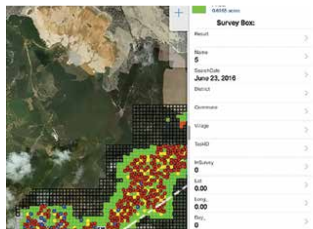
Figure 2. Sample CAST data-entry form.

CAST is one example of how utilizing mobile GIS technology early in the demining process can improve mine action survey operations by providing detailed data collection and mapping of landmines and UXO in post-conflict areas where civilians are at risk. CAST is efficient by improving the reliability and accuracy of current field data collection methods.