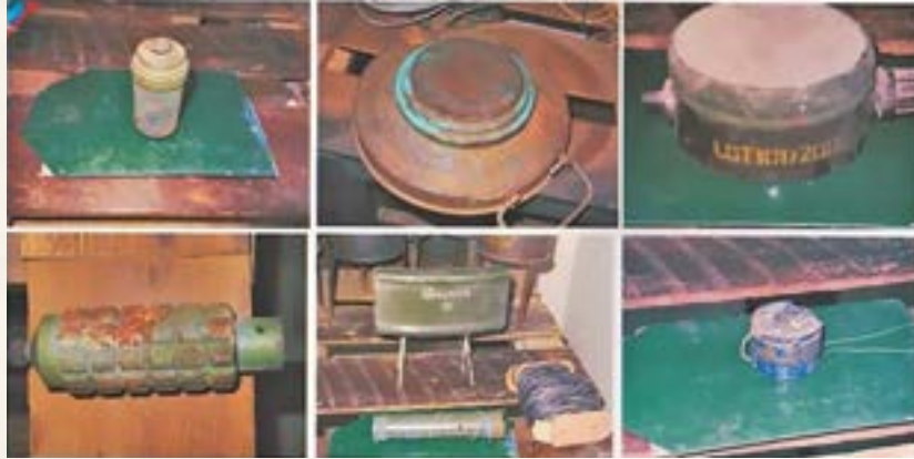
Landmines believed to have been used in Myanmar.

The study managed several complications and limitations, the most important being the absence of a systematic and organized victim information system (VIS) in Myanmar. Information collection has been sporadic and inconsistent throughout the country, and providing reliable figures on the impact that landmines have on society is impossible. Due to the continuation of armed hostilities between national armed forces and some of the NSA groups, mine action is still a very sensitive issue, and information about victims remains touchy. The absence of a victim-surveillance mechanism is detrimental to the assessment of the contamination and the accurate documentation of its humanitarian consequences. This unavailability also hinders the planning and implementation of victim assistance programs that could provide the required support to survivors and their families.