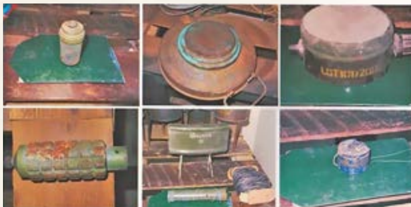
Landmines believed to have been used in Myanmar.

The study managed several complications and limitations, the most important being the absence of a systematic and organized victim information system (VIS) in Myanmar. Information collection has been sporadic and inconsistent throughout the country, and providing reliable figures on the impact that landmines have on society is impossible. Due to the continuation of armed hostilities between national armed forces and some of the NSA groups, mine action is still a very sensitive issue, and information about victims remains touchy. The absence of a victim-surveillance mechanism is detrimental to the assessment of the contamination and the accurate documentation of its humanitarian consequences. This unavailability also hinders the planning and implementation of victim assistance programs that could provide the required support to survivors and their families.