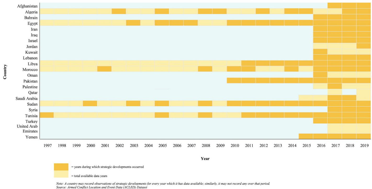
Figure 3.1: Years During which Decisive Government Actions were Recorded, by Country

actions’ for clarity. 172 However, because the analysis is selecting only three variables codes out of over thirty possible variable codes, the possible sample size was greatly reduced both as a function of there being fewer total observations as well as the observations not being evenly distributed across the region. Although this presents a serious limitation on the extent to which the findings can be generalized that must be acknowledged, it does ensure the measurement validity of the study remains strong due to the selection of only the most relevant observations for the analysis. Figure 3.1 illustrates the available data for the country-year unit of analysis which will be used for this analysis.