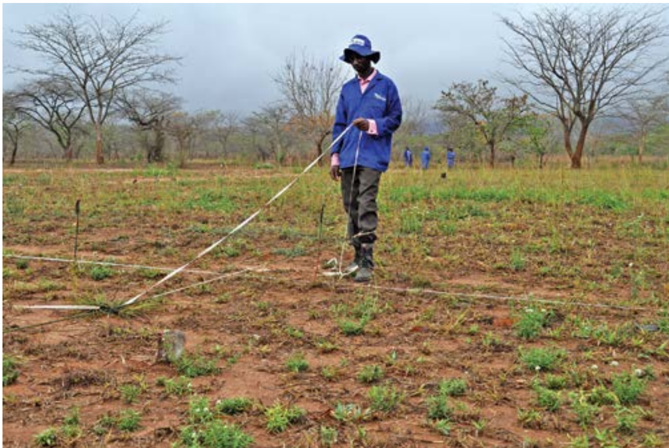
The rat's location is easily calculated in x and y coordinates.

setting and reinforcement setting were the same. In some applications, APOPO's rats searched for landmines (and other explosives) in areas that had first been cleared of vegetation by a brush-cutting machine or rototilled by large armored machines that sometimes fail to detonate every piece of unexploded ordnance. Because training fields cannot be rototilled in ways that mimic minefields, grass-covered, pre-prepared boxes were hoed by hand to uncover raw soil and used as the two settings of interest.