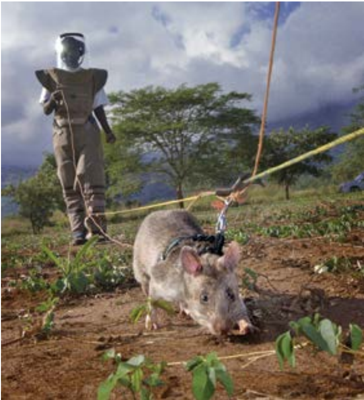
Close-up photo of a pouched rat in training.