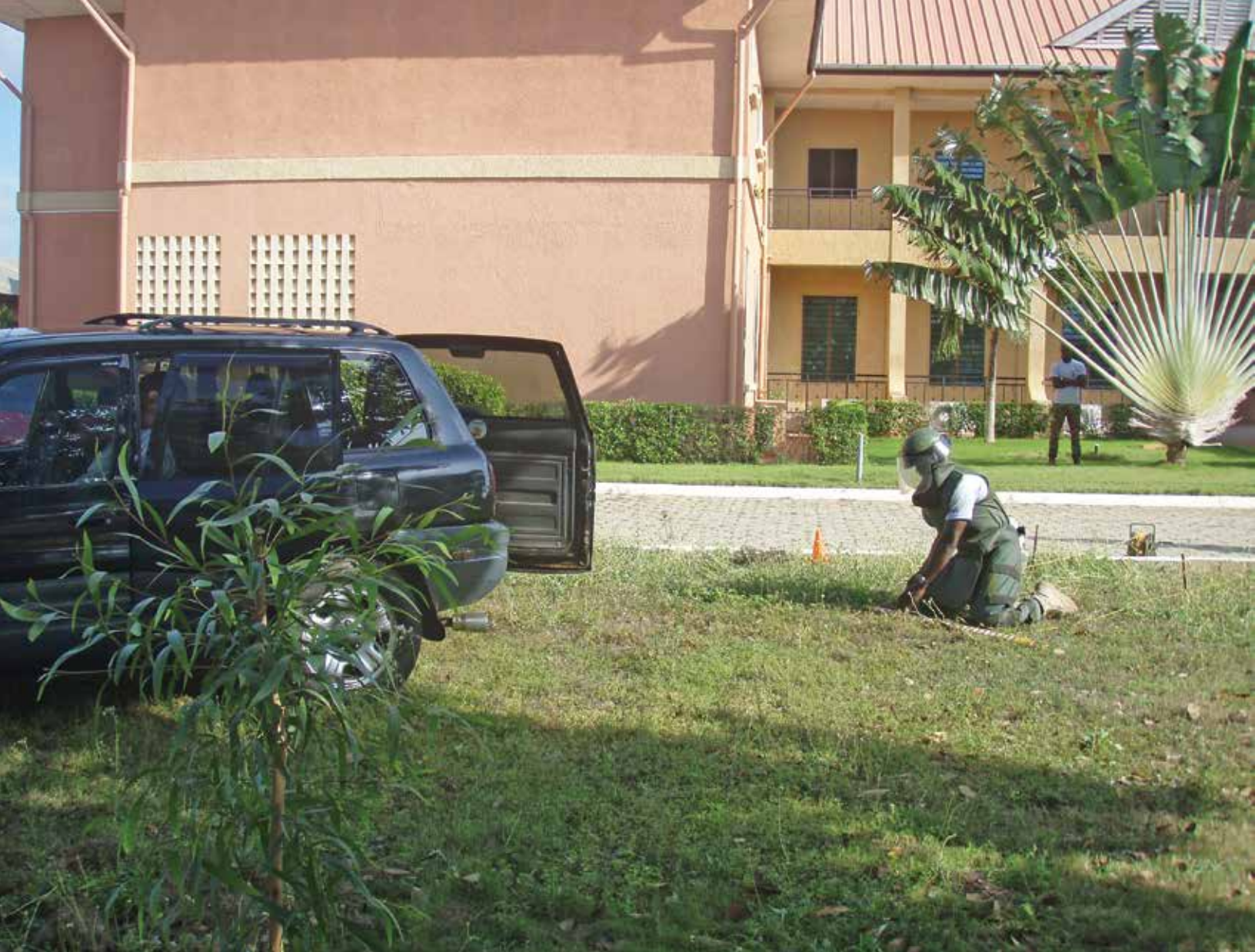
A simulation exercise in a city environment. After having secured a safe perimeter, the trainee is creating a safe path to the suspicious car.