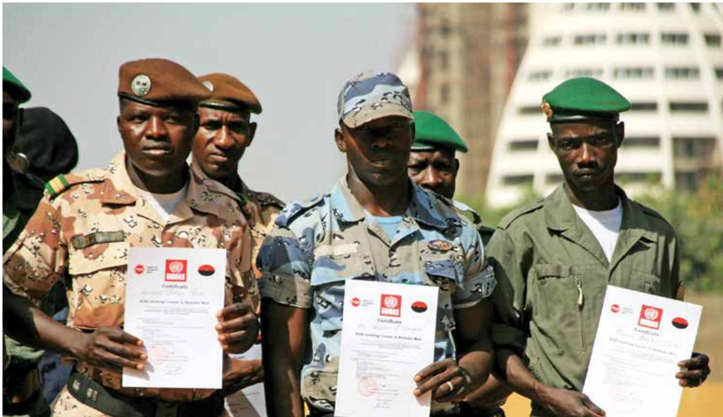
Participants from the Malian Defense Security Forces receive their EOD Level 1 training certificates.

Recent and ongoing armed conflicts in Mali have resulted in small arms and light weapons proliferation and explosive remnants of war (ERW) contamination, threatening civilians and impeding stabilization efforts. In the northern affected communities, ERW contamination increases risks of accidents and injury, and hinders the safe return of more than 170,000 refugees and 187,000 internally displaced persons. 1