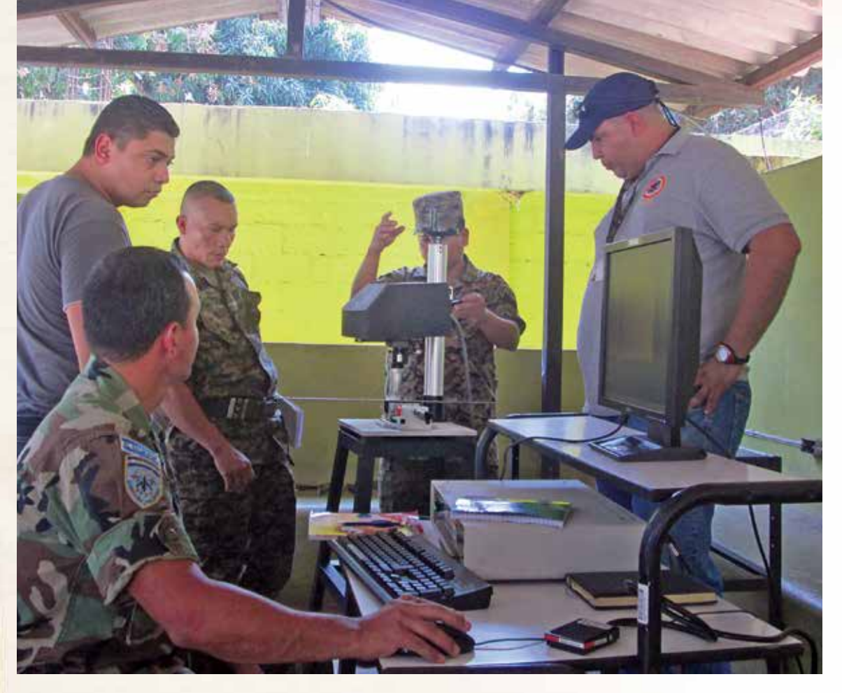
Training includes instruction on the use of the marking machine, setup and calibration, data configuration, storage, and technical procedures related to marking and record keeping.

equipment. After receiving reports from some national authorities on the difficulty involved in marking certain types of firearms due to lack of proper equipment, 30 vises for holding the firearms while they are marked were donated to requesting countries between 2012 and 2013. In addition, between January 2013 and May 2014, seven marking machines were turned over to national authorities, and OAS carried out refresher training in Dominica and El Salvador.