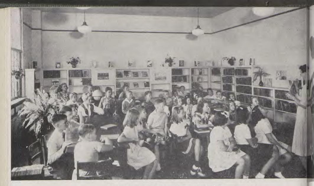
Story Hour-J. E. B. Stuart School, Norfolk