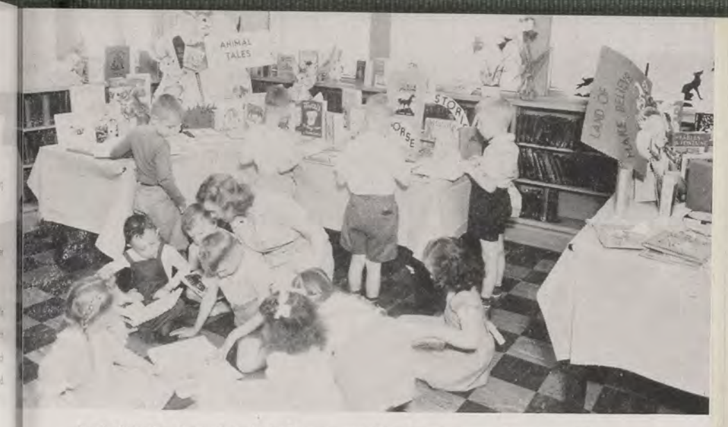
Pupils Selecting Animal Books in Elementary Public School Library, Petersburg, Va.