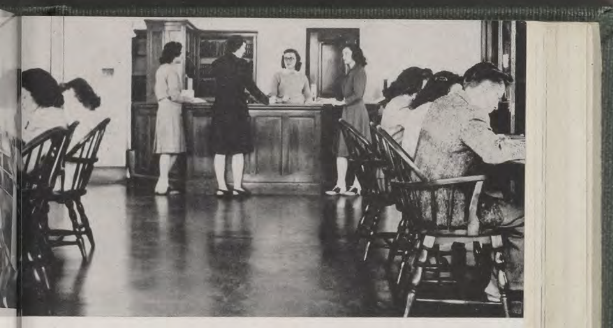
In the Madison College Library

course, but also with adults because of her many contacts with other teachers. Her work with students and teachers will be more pleasant if she is naturally tactful and patient, and her library will be more valuable to the school if she is mentally alert and resourceful.