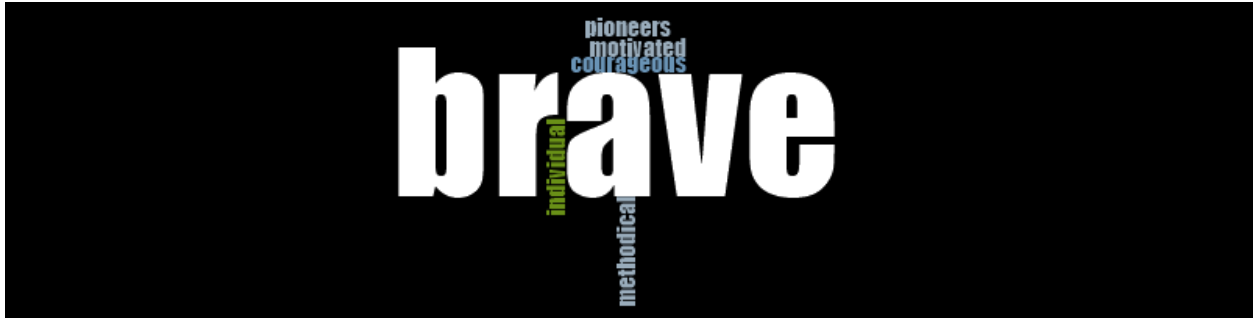
Figure III - Word Cloud for Descriptors (Character, Ability, Personality)

In the survey responses, the deminers used approximately twenty-eight different descriptors to describe themselves. The most common descriptor word women used for themselves was “proud.” Other common descriptors that were used included: happy, soldiers, brave, professional, and heroes. In single instances, descriptors included tired, united, strong, sensitive, protector, defender and delicate. However, when looking at specific word choice, one should be reminded that all surveys are translated, and therefore, it is somewhat up to the translator’s discretion. However, even with this caveat, many words or similes do seem to be common across the surveys. There were instances where the women used these descriptors for themselves as well as their team or women deminers as a group. The deminers accurately used a number of the same descriptors found in the popular narratives when expressing what they knew of women deminers in the media.