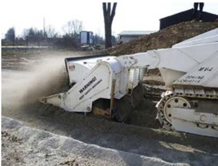
Figure 10. Statistical test run.