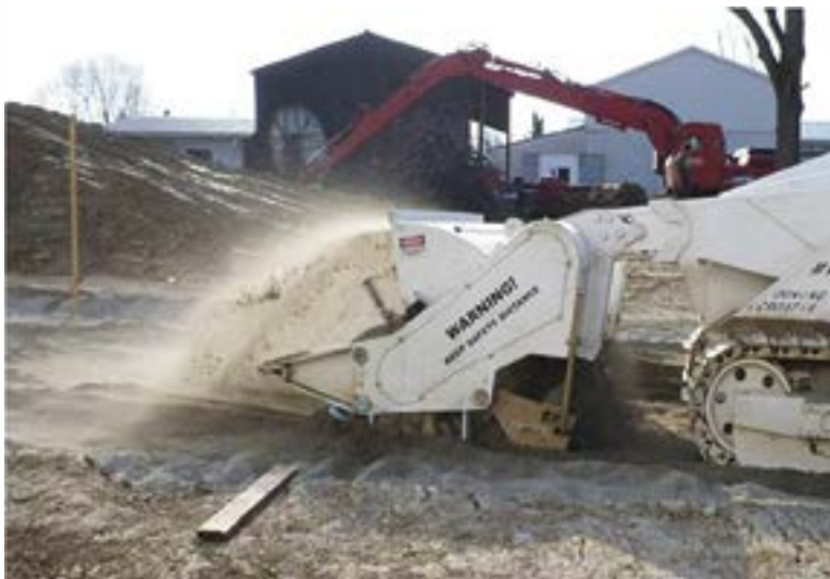
Figure 8. Increased soil turbulence with magnetic roller in lowest position.