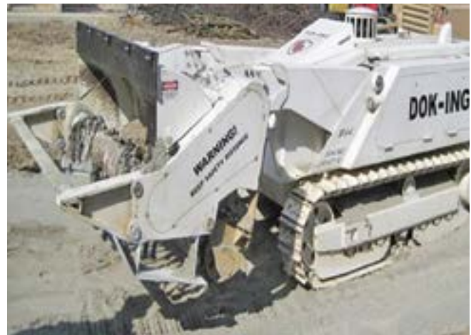
Figure 1. DOK-ING MV-4 utilized during testing.

GICHD recognizes that, combined with mechanical tools or as stand-alone assets, magnets can increase manual clearance productivity by removing ferrous metal debris from the clearance area. In addition, the collection of metal debris can provide invaluable information about