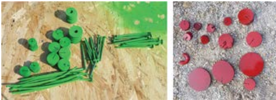
Figure 5. Ferrous debris utilized during testing.

lodged if it comes into contact with one of the magnetic collectors. Testing of the magnetic roller showed that collection was much more effective if the roller was set as low as possible (centerline of the roller was approximately 5 cm above the flail skids), allowing the roller to plow through the soil deposited just behind the flail head. As the machine advanced, the roller would push a large mound of soil ahead of it, causing flailed soil to be pushed back into the path of the upward-moving flail hammers. Forward soil ejection from the top of the flail shield increased dramatically compared to previous