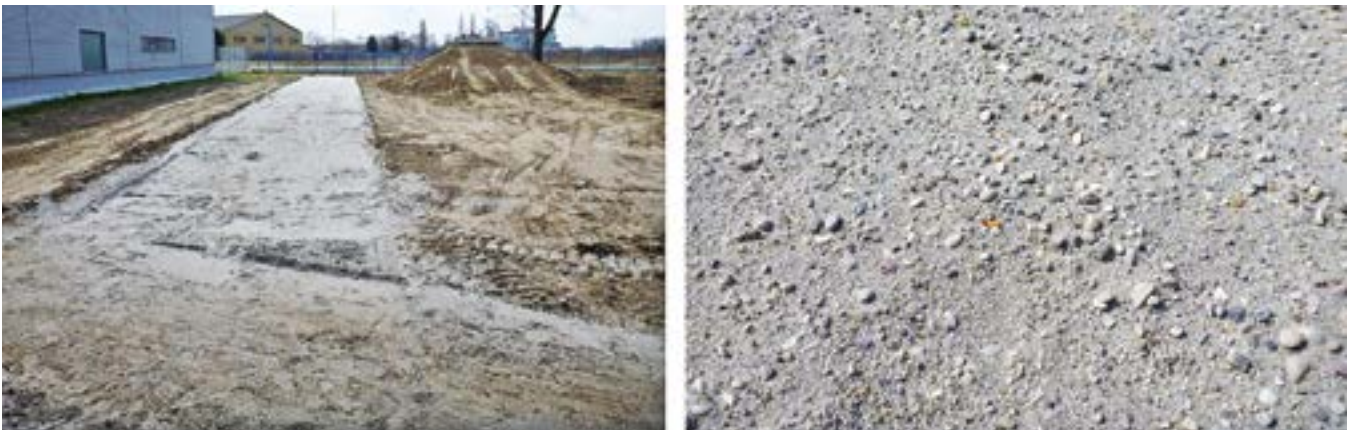
Figure 6. Test lane and close-up of soil.