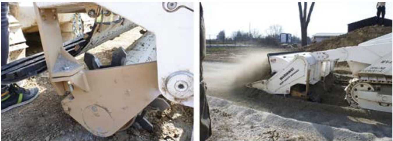
Figure 7. Machine setup for statistical testing.