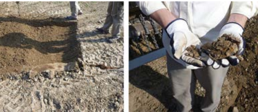
Figure 13. Qualitative topsoil test and collected debris.

may be effective in soil conditions other than dry, loose sand. It also shows that magnets are effective at capturing ferrous debris covered with substantial oxidation and other surface contamination conditions likely to be found in the field.