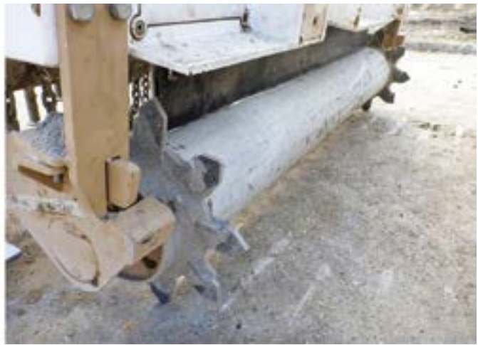
Figure 2. Magnetic roller attachment.