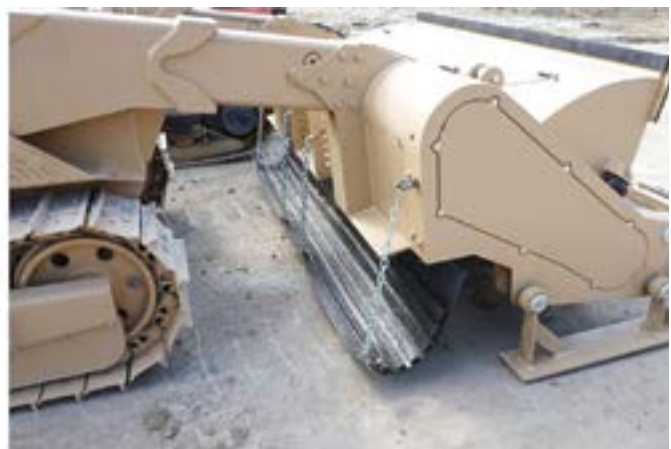
Figure 3. Magnetic sheet attachment.

242 neodymium permanent magnets (each 42 mm by 40 mm by 6 mm) spaced evenly, adhered directly to the base metal roller and covered with an abrasion-resistant rubber. Field strength of the magnets was 0.17 Tesla on the dorsal and ventral faces, and 0.34 Tesla on the lateral faces.