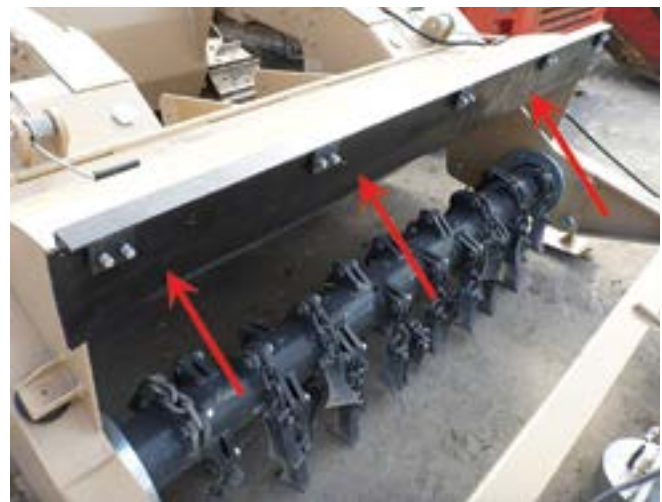
Figure 4. Magnetic upper catch attachment.

Testing was performed in a prepared lane at DOK-ING's main production facility in Zagreb. The test lane was approximately 45 m long, 4 m wide, 0.5 m deep and filled with relatively fine riverbed sand (Figure 6, page 54).