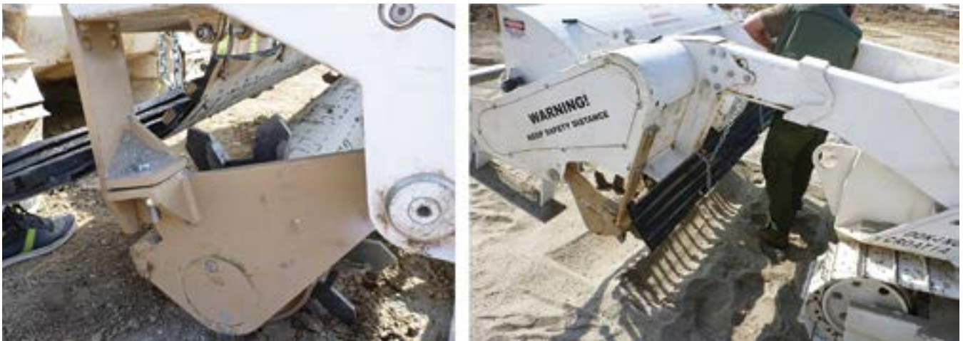
Figure 9. Optimal configuration of the magnetic collection system.