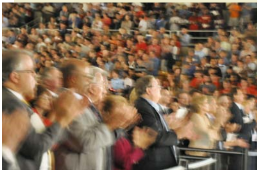
A capacity crowd of students, professors, alumni, community members, performers and media congratulate former President Jimmy Carter and his wife, Rosalynn.

The difficult, delicate and at times unpopular work that is required for waging peace has involved the former president in frequent travel