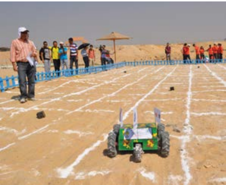
Competition arena with buried and surface mines.

wood or even football casings. Furthermore, casings and components degrade over time, altering their detection signature and creating uncertainty as to how mines will withstand clearance. Additionally, thick deposits of mud or sand cover many landmines and UXO, rendering conventional detection techniques mostly ineffective.