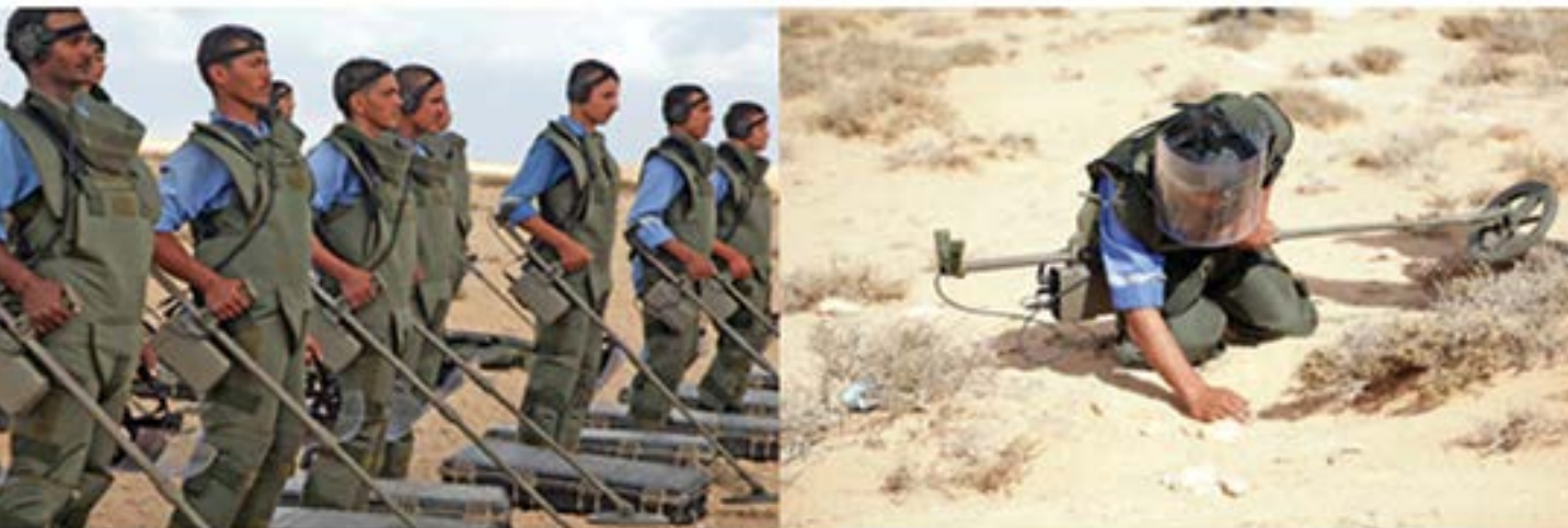
Conventional manual landmine detection methods. Executive Secretariat for the Demining and Development of the North West Coast.

The extent of contamination is unknown, but the amount of affected land is estimated at nearly 25,000 sq km (9,653 sq mi) with areas between the Quattara depression and Alamein and near Marsa Matrough and Sallum being particularly affected. 1,3 Landmines and unexploded ordnance in the region are as much as 60 years old, and contamination involves hundreds of types of landmines. Mines can have metal, plastic,