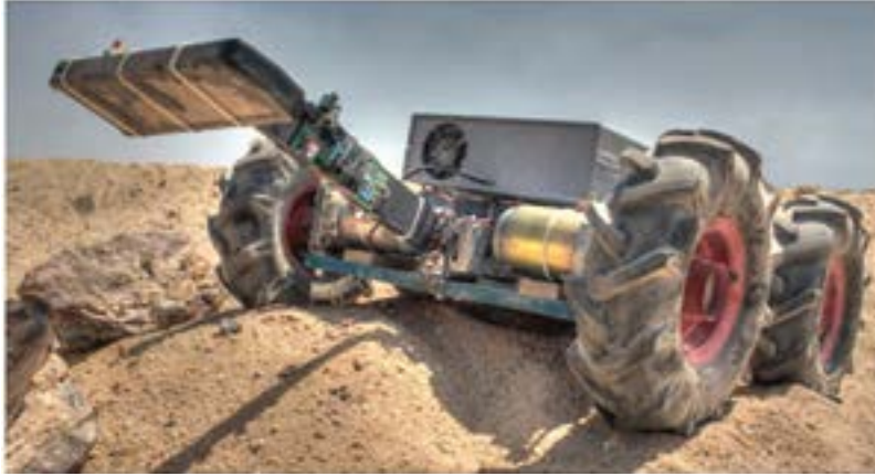
EMAR, a four-wheeled unmanned ground vehicle placed first in the competition.

challenging aspects of landmine and UXO detection and removal, such as difficult terrain that requires careful attention to the design of the robot's locomotion system. The harsh climate also requires the use of high tolerance and rigid electronic components. Many robots failed during the competition due to the use of traditional room-temperature electronics.