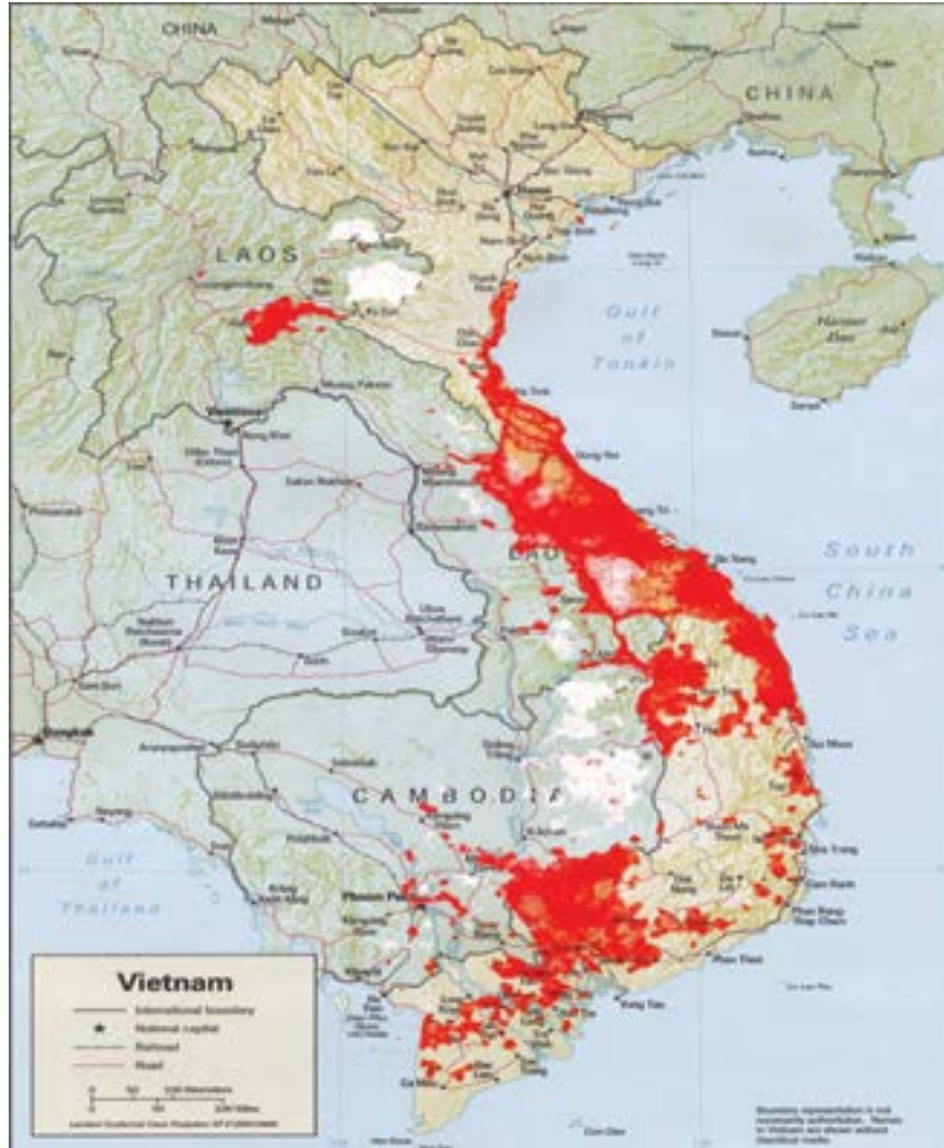
Figure 1: Map of U.S. bombing data in Vietnam and Laos.

UXO. All MRE messages are concise, instructive and written so that children may easily read and understand them. This information includes common shapes and sizes of landmines/UXO and information about the danger posed by old, rusty ordnance even years after a war. Primary schoolchildren are not taught to specifically identify landmines/UXO, because they are naturally curious and the desire to identify ordnance may cause them to purposely get close to or touch them.