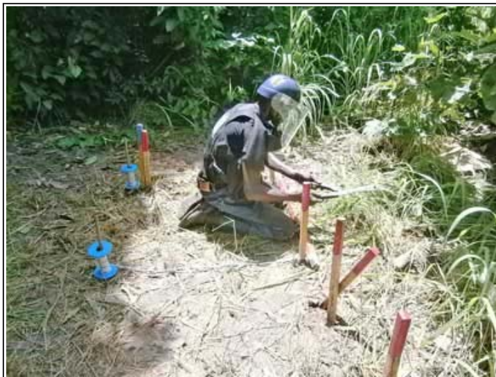
A Mechem deminer in Senegal, 2012.