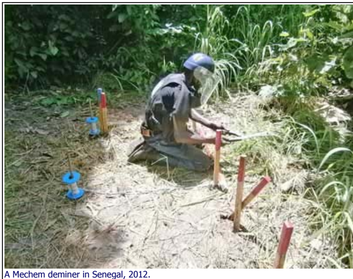
A Mechem deminer in Senegal, 2012.

Numerous explosive ordnance disposal personnel and others working in mine action benefit from the network and the advice of its professional members. Requests for assistance in identifying ERW rarely remain unanswered due to the proactive nature of the forum's participants. To date the forum has proven to be especially useful in Libya, where forum members communicated through it for safety reasons.