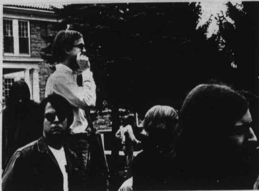
Residents of Madison's dorms gather in an opening meeting on the quad on April 12 to discuss Open Dorm policy.