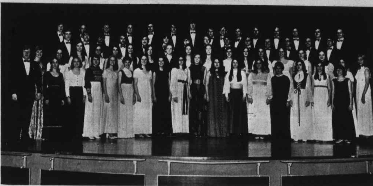
The Madison College Chorale will give their home concert this Sunday at 3 p.m. in Wilson Auditorium. They have just returned from a tour of Northern Virginia.

STEELE'S BARBERSHOP Downtown Harrisonburg Mon., Sat. - 8 am-6 pm Tues., Wed., Thurs., Fri. 8 am-8 pm