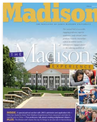
Read any issue of Madison online at www.jmu.edu/MadisonOnline .