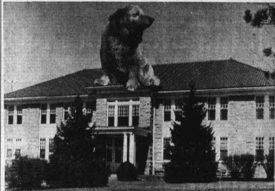
"Hey, this roof is getting cold! Take those movies and get me off of here! Do I ever lead a dog's life!"

The future looks bright for Madison College whose fame is predicted to reach new heights this spring when Hollywood will descend upon it for the production of the latest MGM — Mossolini, Gable, Malenkoff — movie, "Dog on a Cold Terazza Roof."