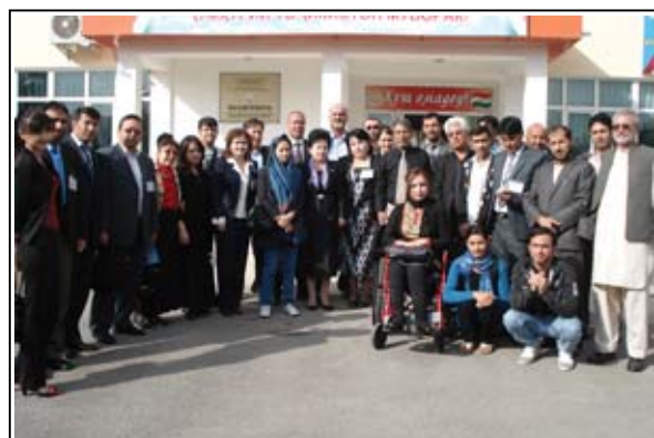
Conference participants visited different departments of the

Following on the success of the first conference, the Tajikistan Mine Action Centre, in cooperation with the Ministry of Labour and Social Protection of the Population of the Republic of Tajikistan and the United Nations Development Programme, organized the second Regional Psychosocial Rehabilitation Conference, which was held in Dushanbe, Tajikistan, 19–20 October 2011.