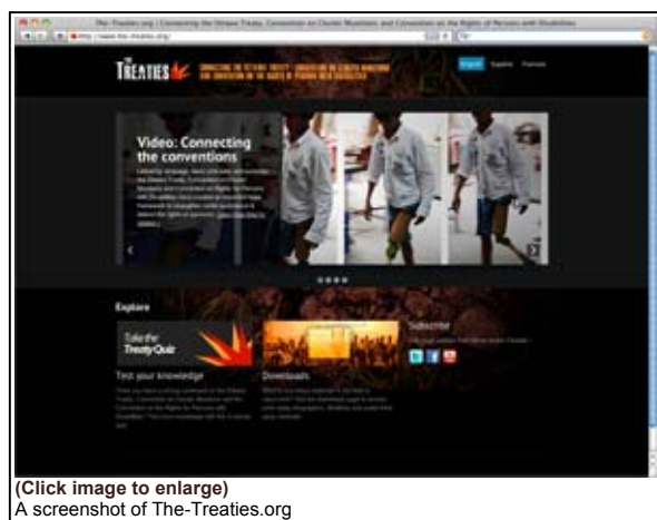
(Click image to enlarge) A screenshot of The-Treaties.org

Mines Action Canada has launched a new interactive online tool to explain and make connections among three groundbreaking international humanitarian treaties: the 1997 Convention on the Prohibition of the Use, Stockpiling, Production and Transfer of Anti-personnel Mines and Their Destruction (also known as the Anti-personnel Mine Ban Convention or APMB), the 2008 Convention on Cluster Munitions and the 2006 Convention on the Rights of Persons With Disabilities.