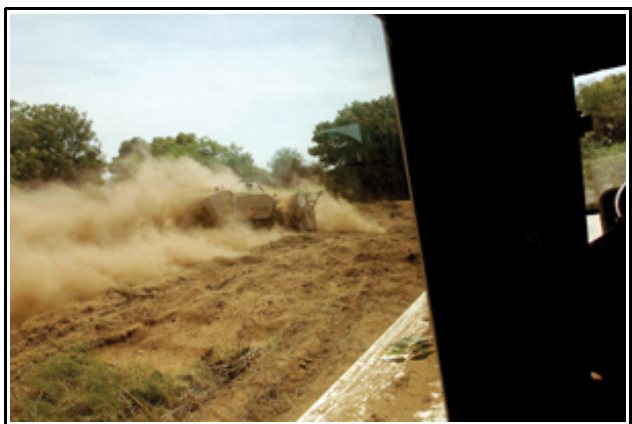
Engineers from ArmorGroup use MineWolf demining machines to clear AP landmines under a program coordinated by the UNMAO in consultation with the Government of Southern Sudan and other national and international actors. Approximately 2,000 AP mines

The North's demining program, the National Mine Action Authority, and the South's, Southern Sudan Demining Authority, were created by two separate presidential decrees after an agreement with the U.N. agency for Mine Action Capacity Building and Programme Development in Sudan.<sup>9</sup> Both organizations, with funding from outside organizations such as the United Nations Mine Action Office and the United Nations Development Programme, have made significant gains to remove landmines and UXO during the six years of relative calm and peace following the civil war.