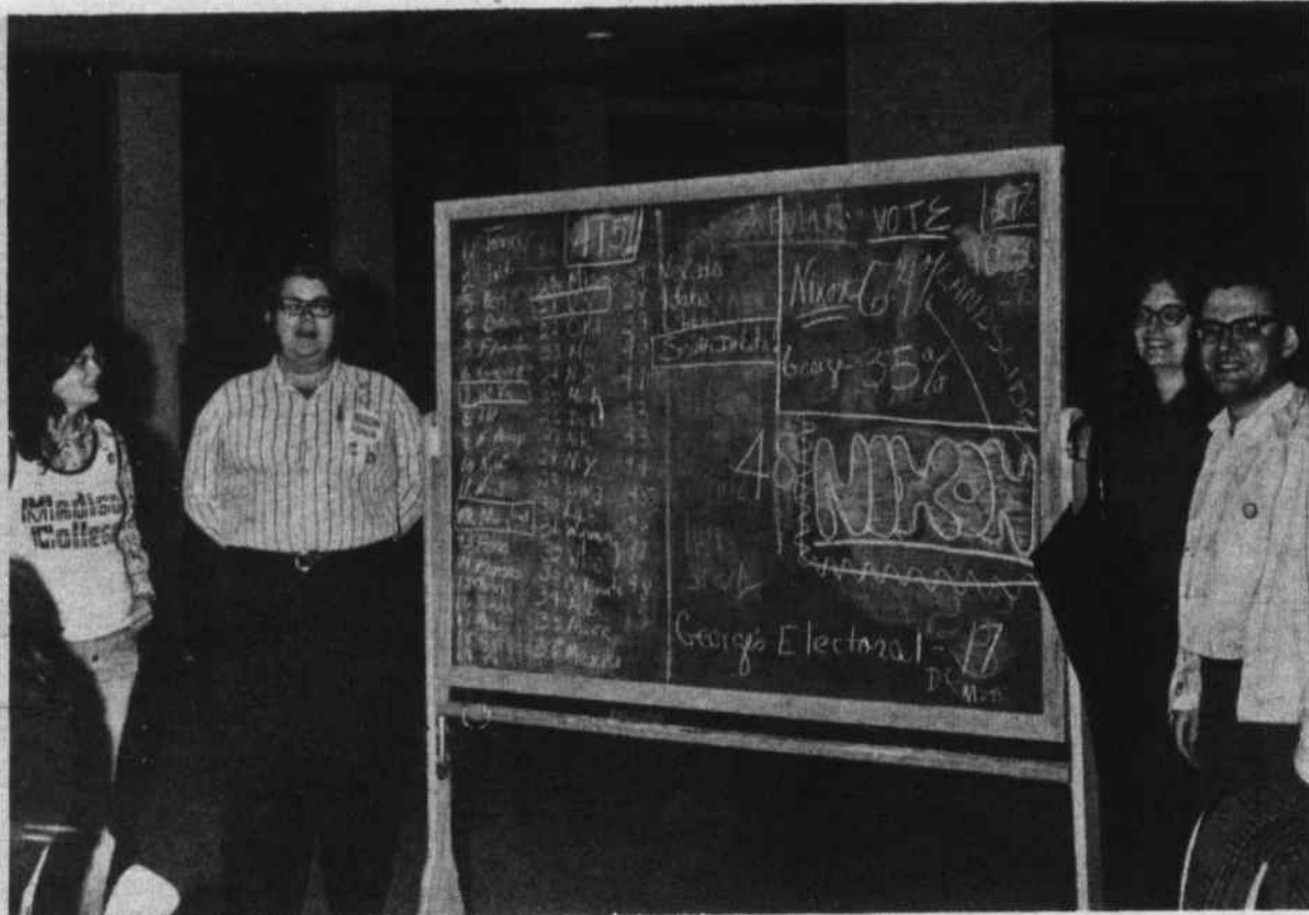
This was the scene of the jubilant College Republicans on election night 1972. Wonder

Upon investigation, we have discovered that there is no truth to the rumor that Agnew will also be teaching the Advanced Golf course here next fall.