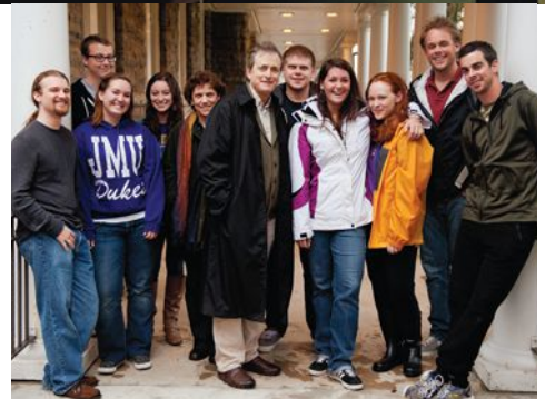
Chasing Hollywood dreams 20 students intern in Los Angeles PAGE 8