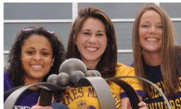
Google this JMU students take top prize in 2011 Google Marketing Challenge PAGE 11

Madison Art Collection director brings alumni photographers' work to life PAGE 38