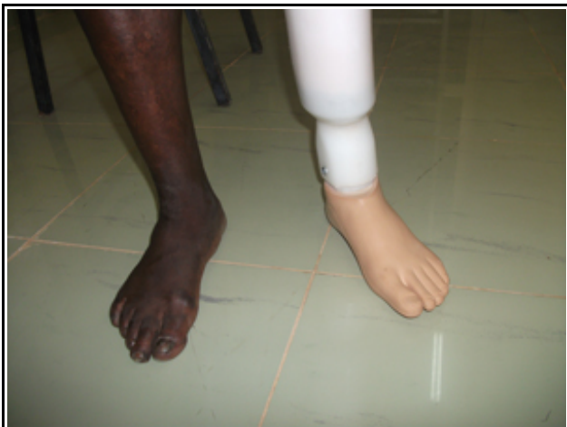
The SACH foot looks like a real foot, is less expensive than the Flex foot and is easy to fit and use.

Because of this increased flexibility in the leg's shaft, Sudanpro does not require the expensive Flex foot used in other prosthetics to achieve the same flexibility. Instead, Sudanpro replaces the Flex foot with a much cheaper SACH foot, manufactured by the Chinese government.