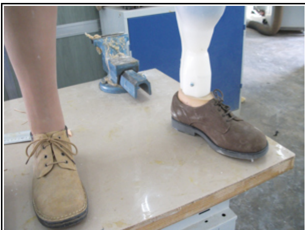
The SACH foot easily fits in a shoe.

tolerance, making Sudanpro a more durable prosthetic. Having fewer parts also reduces the overall weight of the prosthesis by about 30 percent. Taking into consideration lost momentum, this decreased weight saves patients energy in their strides.