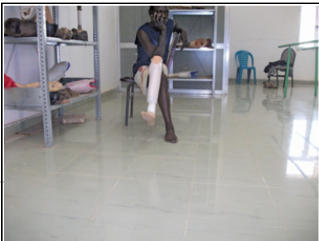
The total cost of the SACH foot per leg is less than US$100. More than 1,400 people have been fitted with this kind of prosthesis.

In many developing countries, orthotic and prosthetic practitioners are without the resources to meet amputees' needs. According to many estimates, there are around 60 million amputees. Often the high cost of prosthetics and the intense labor required to produce these devices limits organizations in the number of people they can serve. A lack of resources availability further hinders efforts in the field, as Western prosthetics often require materials unavailable in developing countries. Available resources are also often too costly for wide distribution.