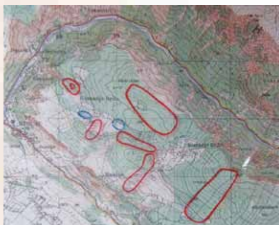
Image 1 (top left). Infrastructure and meeting places (black). Image 2 (top right). Key agricultural land (green) and water sources (blue). Image 3 (bottom left). Paths used by hunters (purple). Image 4. (bottom right). Areas local people consider to be hazardous (red) and areas already cleared (blue).

be difficult and often makes people uncomfortable. In a post-war community where inter-communal relations are still sensitive, writing and signing a document that will be handed over to the local or national authorities is often perceived as a threatening activity. However, standing around a map and drawing lines and areas on an overlay usually starts a free-flow of information and opinions. This exchange can include controversial or sensitive information, including areas officially mined but considered safe by locals, areas where unofficial and unauthorized mine clearance has taken place, or areas that contain mines despite being officially considered safe. These areas need further verification by a Technical Survey process and the resulting status of each area should be publicized to the local people.