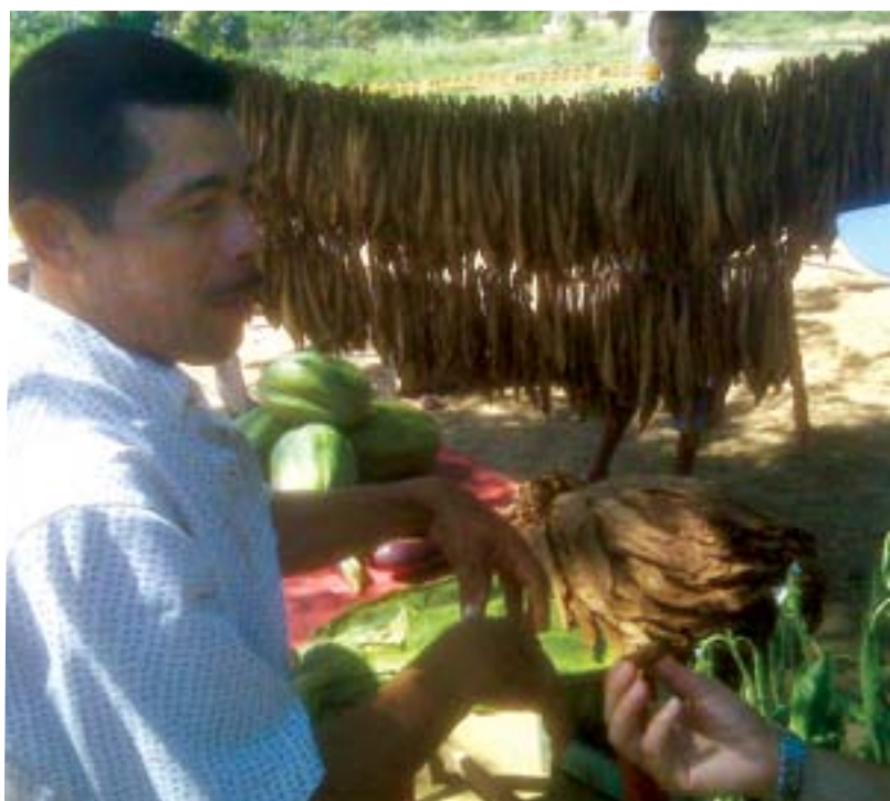
In spite of the danger, inhabitants in Bajo Grande, Colombia, cultivate land next to an area in the process of being cleared.

Following the IMAS line of thinking, the objectives of mine action go beyond security issues and into supporting national development