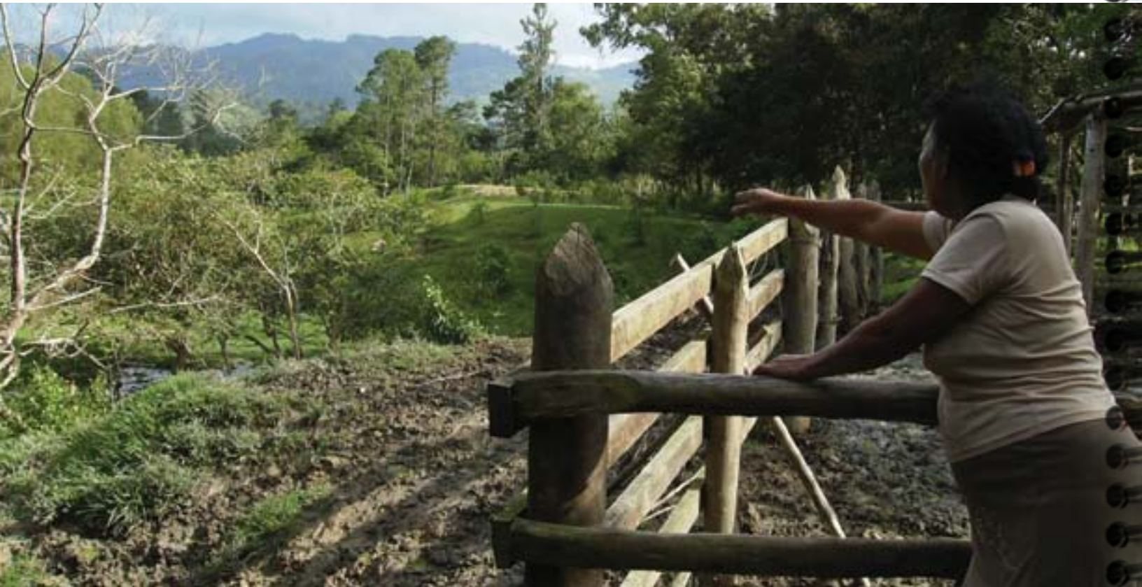
Carmen Galindo looks over her planted plot in El Porvenir, Jalapa, Nicaragua.

efforts as well. Consequently, it is widely accepted that the best indicator of results achieved from the resources invested in mine-clearance operations no longer comes directly from the count of destroyed mines or cleared areas. Instead, most results are now measured by the increase in well-being provided to families, communities and the other beneficiaries of the cleared land.