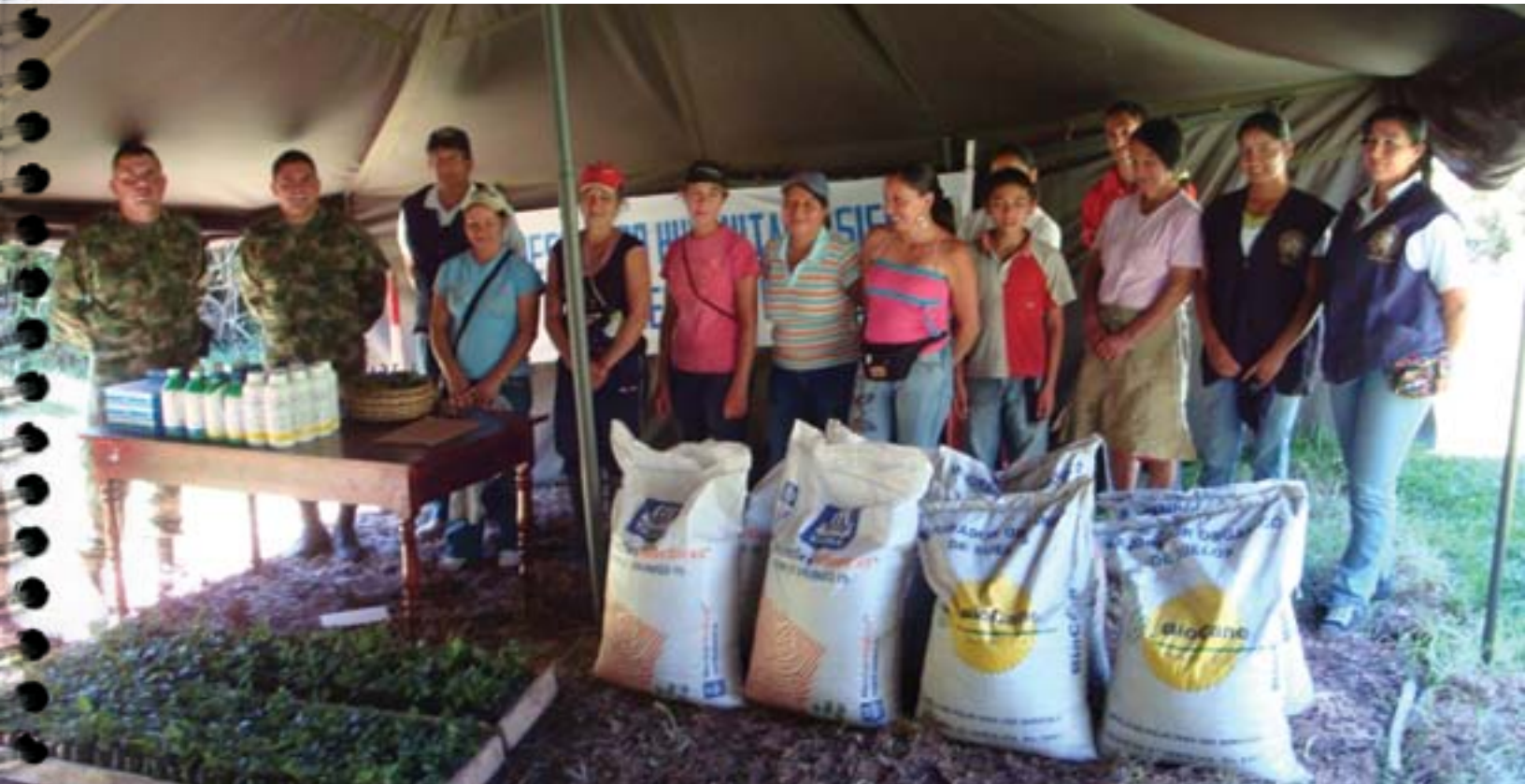
At Las Cochas, Colombia, an area is cleared and beneficiaries receive aid through AICMA-CO.

due largely to the insufficient financial and technical aid provided for its socioeconomic rehabilitation.