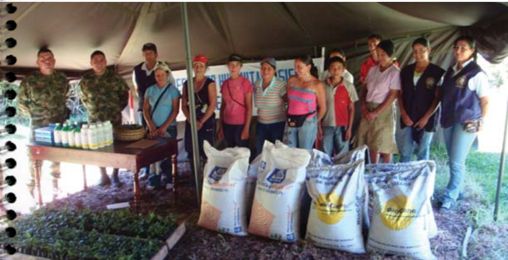
At Las Cochas, Colombia, an area is cleared and beneficiaries receive aid through AICMA-CO.

due largely to the insufficient financial and technical aid provided for its socioeconomic rehabilitation.