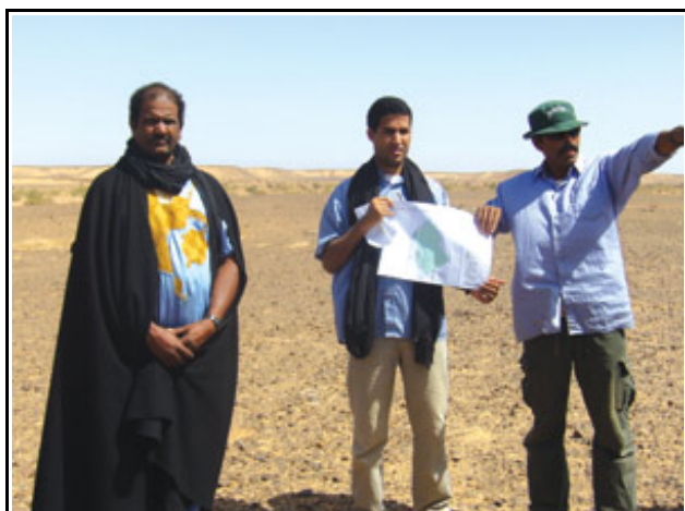
Budib Community handover in June 2008. Pictured left to right: Community Head, GIS Officer and Survey Team Leader.

Western Sahara's 16-year conflict with Morocco caused widespread contamination from landmines and other explosive remnants of war. Landmine Action is a U.K.-based nonprofit organization that has conducted survey, marking and clearance activities in Polisario-controlled areas of Western Sahara since 2006. Its main goals are to make these areas safer for the people of Western Sahara, to reduce risks and land denial caused by contamination, and to successfully carry out humanitarian demining.