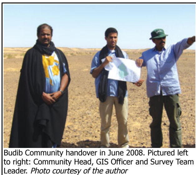
Budib Community handover in June 2008. Pictured left to right: Community Head, GIS Officer and Survey Team Leader.

Western Sahara's 16-year conflict with Morocco caused widespread contamination from landmines and other explosive remnants of war. Landmine Action is a U.K.-based nonprofit organization that has conducted survey, marking and clearance activities in Polisario-controlled areas of Western Sahara since 2006. Its main goals are to make these areas safer for the people of Western Sahara, to reduce risks and land denial caused by contamination, and to successfully carry out humanitarian demining.