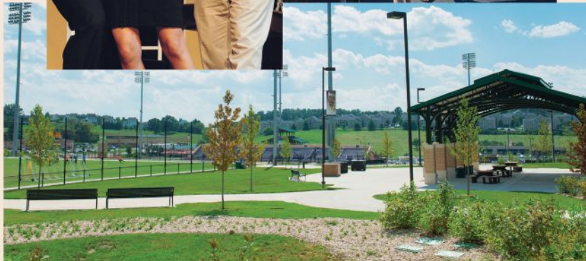
(Top, l-r): Students practice at the Forbes Center for the Performing Arts, students study abroad in Florence and the new club sports venue at JMU's University Park.