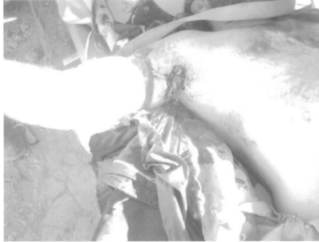
View of Wound to the Armpit