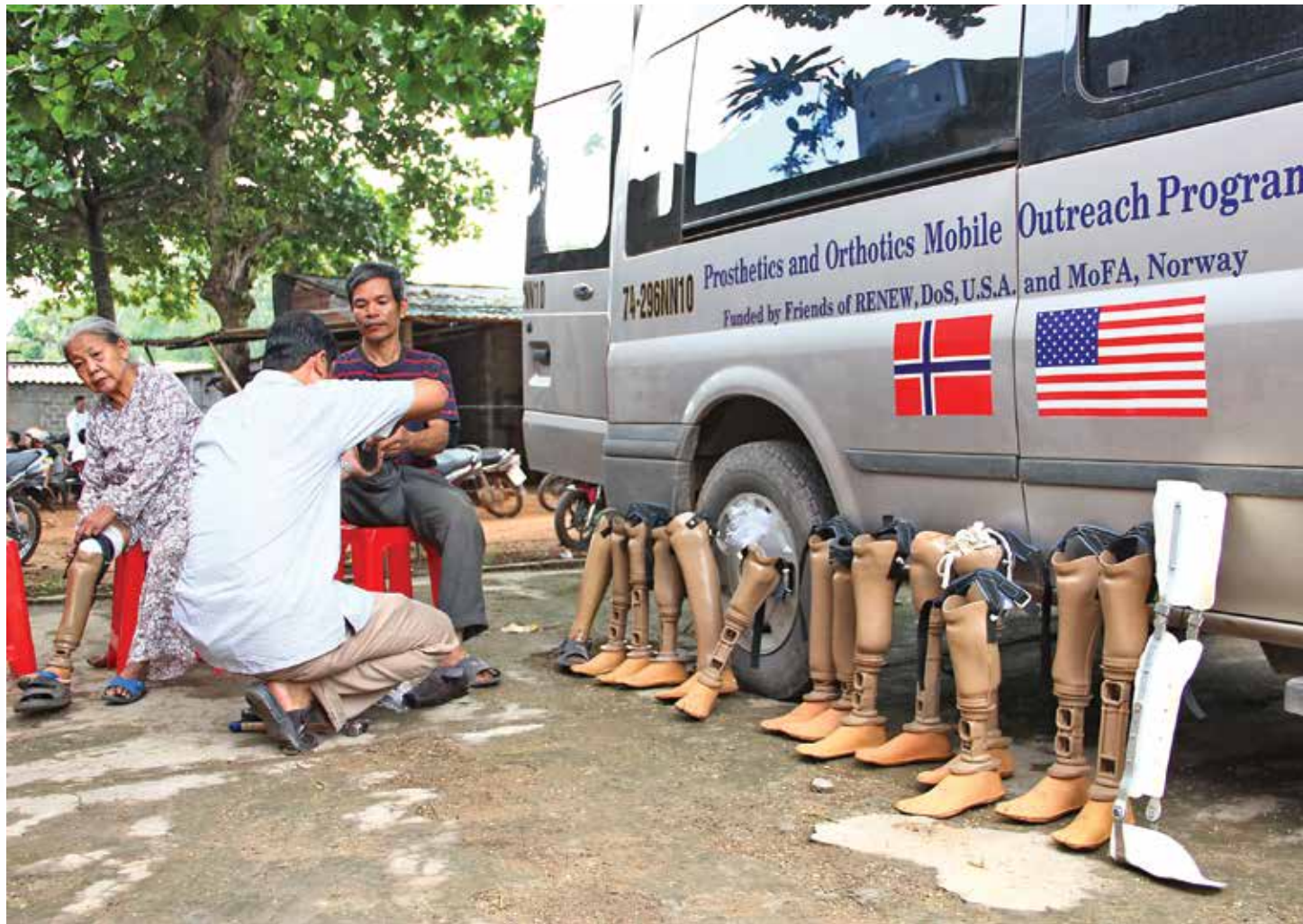
People with disabilities try prosthetics for the best fit and comfort. Adjustments to the prosthetics were made in Gio Son Commune, Gio Linh District, Quang Tri Province.

areas on both sides of the former demilitarized zone (DMZ). 4 During the Vietnam-American War, Quang Tri was one of the most heavily bombed and shelled areas in the history of warfare with 83.8 percent of all land contaminated with UXO, landmines and cluster munitions. 5 Since 1975, ERW accidents have caused 8,516 casualties (3,422 deaths). 3 Quang Tri province was also heavily affected by Agent Orange during the Vietnam-American War. 6 According to the Quang Tri Association for Victims of Agent Orange/Dioxin, Agent Orange/Dioxin has infected and caused disabilities in 15,485 people in the province. 2