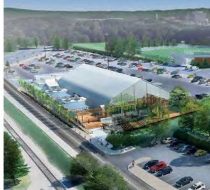
D-Hub, a temporary dining facility, has opened in the parking lot next to Long Field-Mauck Stadium on Dukes Drive.