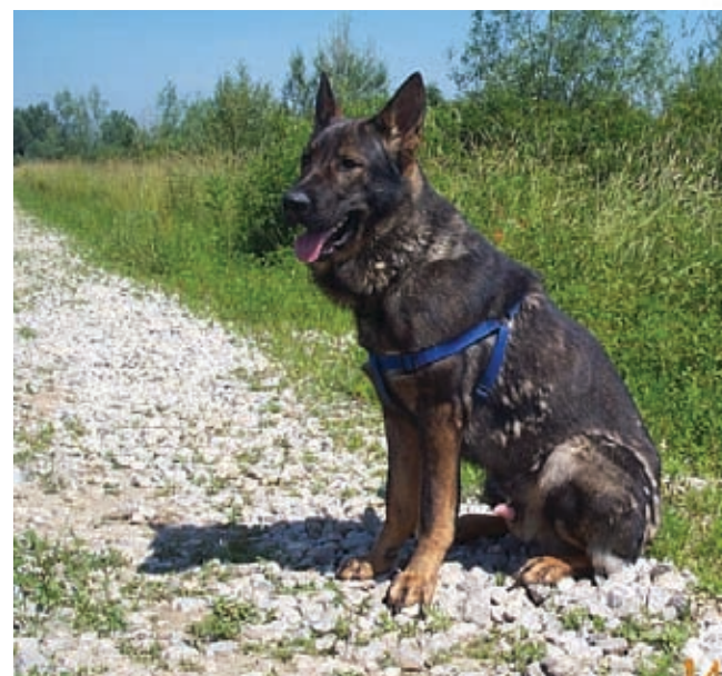
Expecting the call for testing - outer part of Rakovo Polje test site.

Development of demining companies from 1999 to 2000 and especially in the period that followed resulted in the procurement of several dogs and creation of teams for area inspection as a second method after mechanical mine clearance. The level of training for the dogs, trained mostly in foreign countries, depended upon which centre trained them. During this time, CROMAC was active in a number of important international workshops and assemblies, learning about MDD usage. Leading authorities were visiting CROMAC and setting the guidelines for team usage and competence verification modes. When CROMAC took over the commitment of accreditation and testing of demining teams, it started the process of developing the methodology of testing the teams, monitoring their work in the field and constructing test sites.