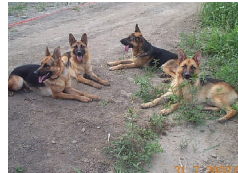
Acclimatization to test site conditions (resting).

The Law on Humanitarian Demining and the Rules and Regulations on Methods of Demining, passed in 2005, enabled the use of dogs and handlers as an independent method in mine-search projects. The ultimate goal, after testing and accreditation for dog and handler, is that all other factors in monitoring and con-