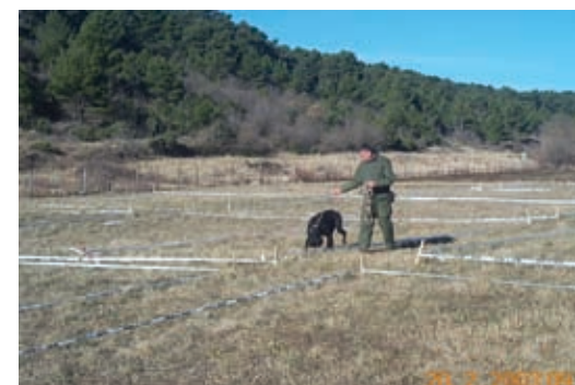
MDD testing at Pridraga test site, May, 2002.

and concrete systems, and areas with significant quantities of metal (water-supply systems, gas pipelines, etc.).