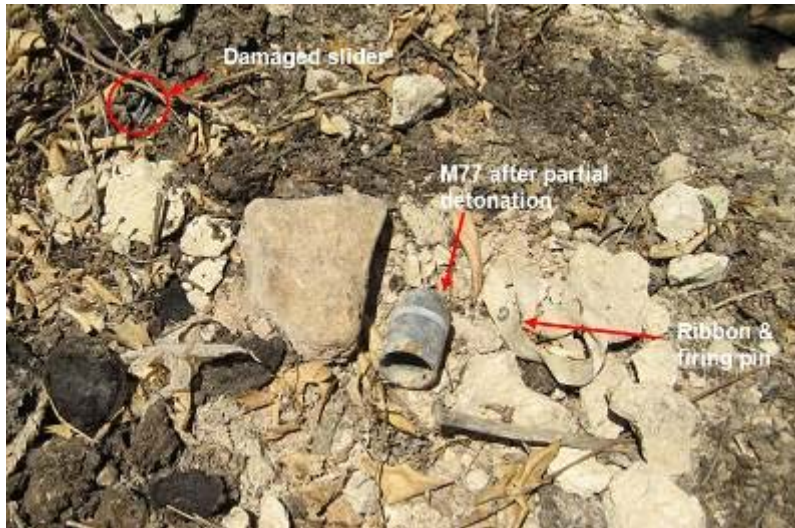
[The copper cone of the shaped charge inside the M77 was visible at one end, and the high explosive fill at the other.]