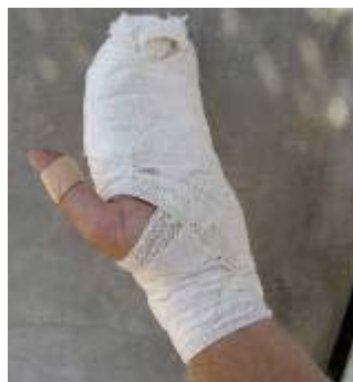
[Pictures of the site and the prodding tools showed that clearance was being conducted, but there was no indication of any detectors that would have allowed sub-surface clearance.]