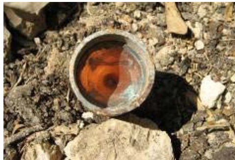
[The Victim's right hand was injured.]