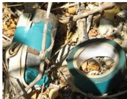
[Pictures of another disarmed M77 showed that this was not a non-intrusive survey. Technical Survey is usually intrusive, but the tasking order from the MAC into the order that "No" clearance be conducted - and this was stressed in Bold.]