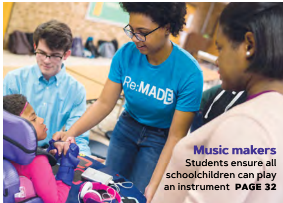
Music makers Students ensure all schoolchildren can play an instrument PAGE 32