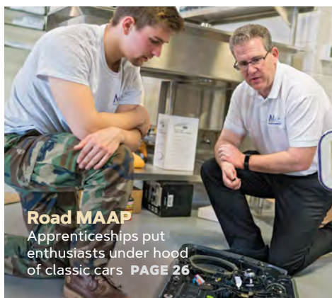
Road MAAP Apprenticeships put enthusiasts under hood of classic cars PAGE 26