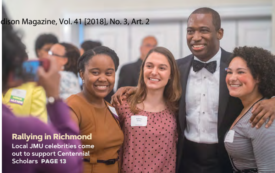
Rallying in Richmond Local JMU celebrities come out to support Centennial Scholars PAGE 13

Middle-school students in JMU's summer Robotics Camp learn from physics professors who employ LEGO technology