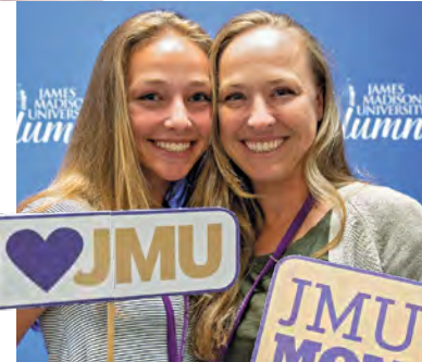
Legacy families share JMU links Generations of Dukes bleed purple PAGE 38