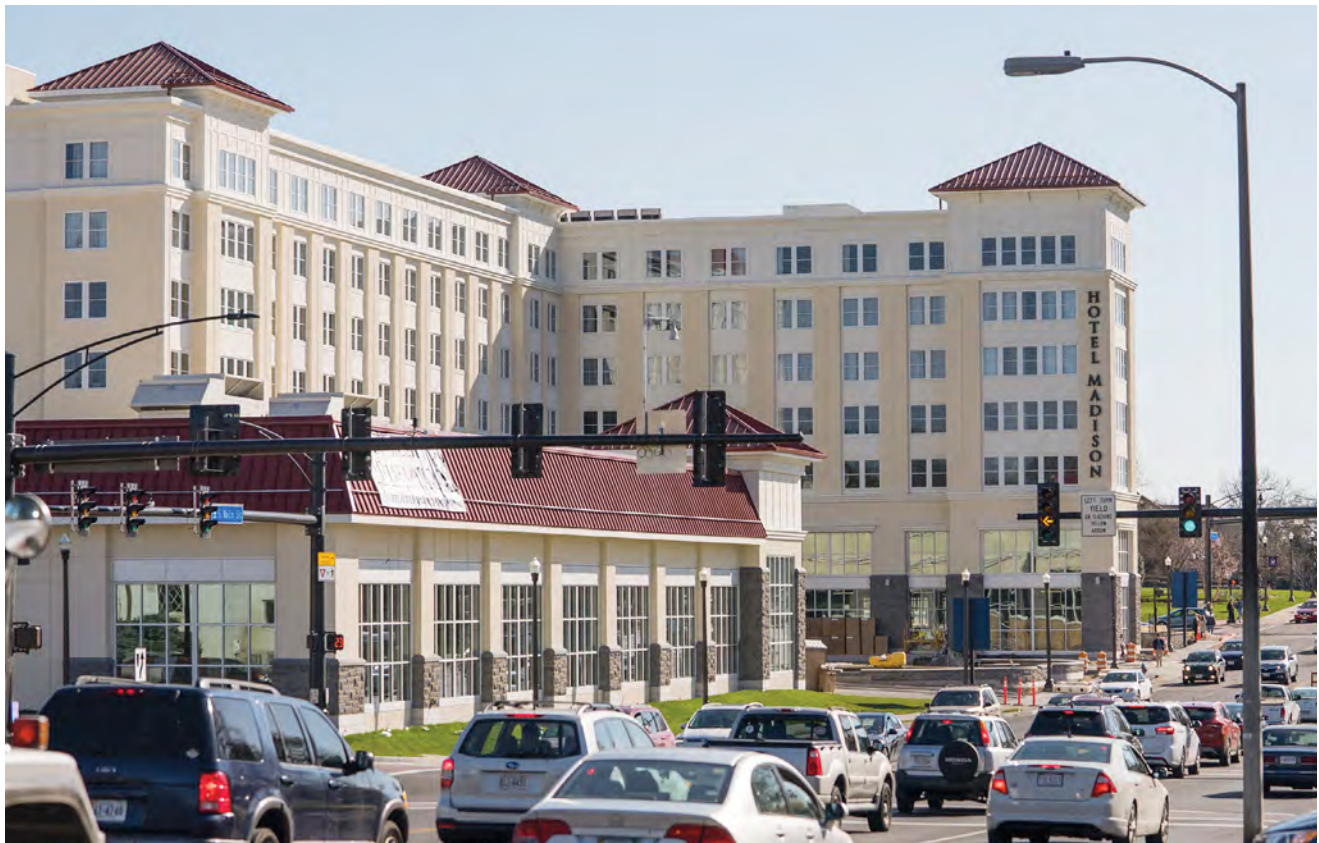
Hotel Madison, located at the corner of South Main Street and Martin Luther King Jr. Way, is scheduled to open May 1, in time for spring commencement. The official hotel of James Madison University, it will feature 230 guest rooms, more than 21,000 square feet of event space and a full-service restaurant.