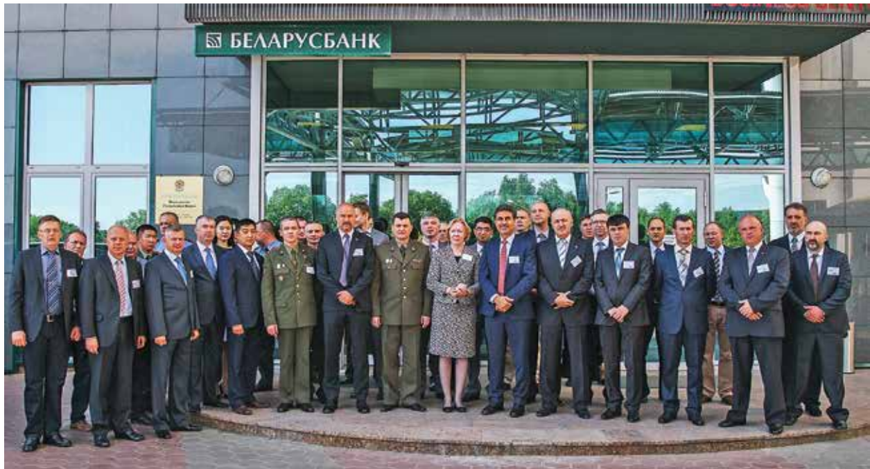
EECCA workshop participants visit the ERW response center of the Ministry of Interior of Belarus. Photo courtesy of GICHD.

by Faiz Paktian [ Geneva International Centre for Humanitarian Demining ]