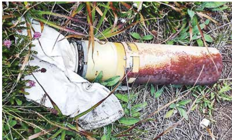
Unexploded BLU-97 A/B submunition at Crni Krs in Oklace community, Zubin Potok municipality.

Based on information received locally, NPA confirmed two NATO strikes in the community. The local population confirmed they feared entering the area surrounding Boljetin village and Sokolica monastery. The police station in Zvečan was also informed by paragliders that they noticed unexploded submunitions from the air. The total hazardous area is 0.06 sq mi (0.15 sq km) or about 30 soccer fields. NPA estimated that at least two RBL-755 cluster bombs were dropped, dispersing