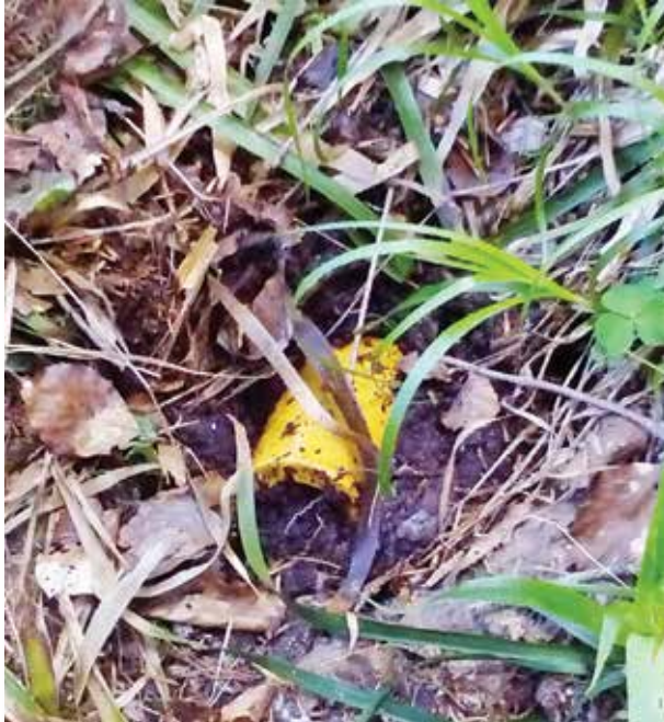
Unexploded BLU-97 submunition at Tovariste in Žazá community, Zvečan municipality.

2014 through July 2015, NPA conducted desk study and field-based, non-technical survey (NTS) to assess and confirm CMR contamination. These activities were done in partnership with local authorities and KMAC.