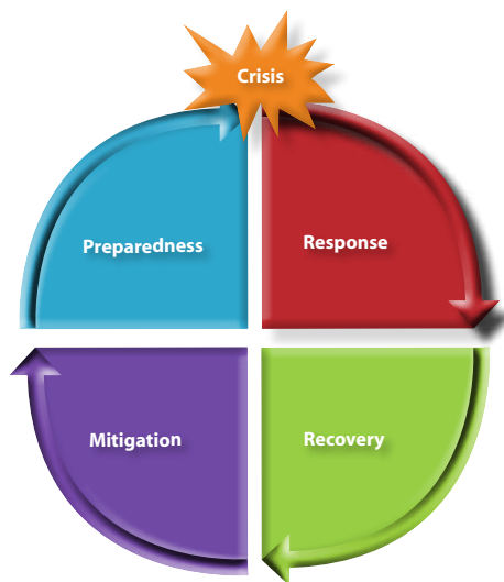
Figure 3. The four phases of disaster risk management.

A robust history of planning and implementing responses to mine/ERW cleanup and natural disasters exists; the two are largely separate fields, but each can inform the situation that occurs when the two overlap. The literature on natural disasters identifies four phases of disaster management: prevention (or mitigation), preparedness, response and recovery (see Figure 3). 15 Experts believe that governments and organizations should address all four phases to adequately tackle natural disaster risk. 15 At issue are matters such as gathering information, coordination, prioritization, redefining impact and needs, roles of different actors, providing appropriate training, interruptions to operations, cost, emergency public information campaigns, international assistance, ensuring the safety of relief workers vis-à-vis explosive hazards, and integrating CWD programs with larger relief efforts. In addition to these concerns of preparedness and response is the