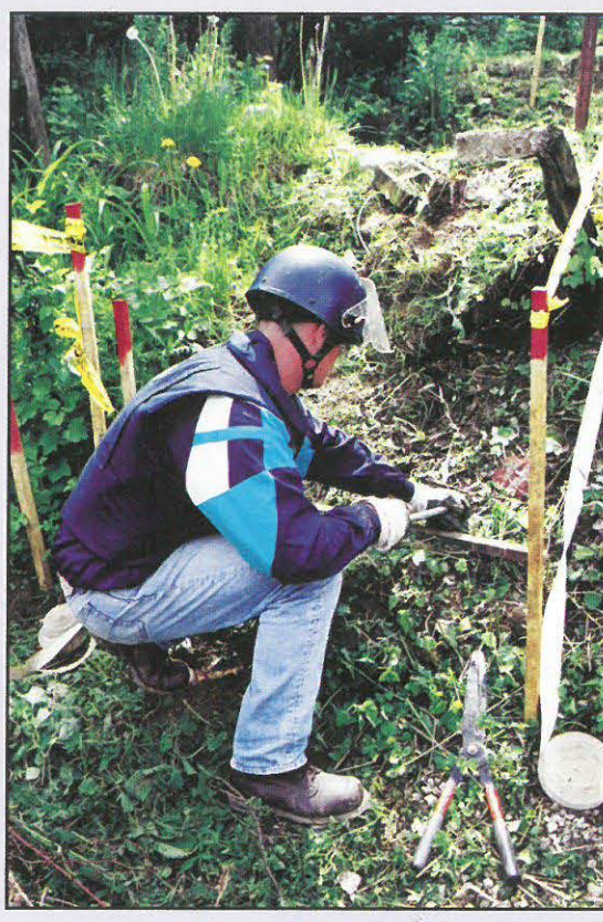
Deminer from NPA probing the ground for landmines.

It's winter now in Dropci, but we know that soon after the snows melt, and the frozen Bosnian terrain begins to thaw, the mines will be cleared and the refugees will be able to return to their homes, their farms and the beginning of a new, more normal life. We know that we in Monterey County can never solve the global landmine crisis, but we also know that we can make a difference. For the rest of their lives, whenever reference is made to landmines, our donors will know that when given the choice between doing something and doing nothing at all, they chose to do something.