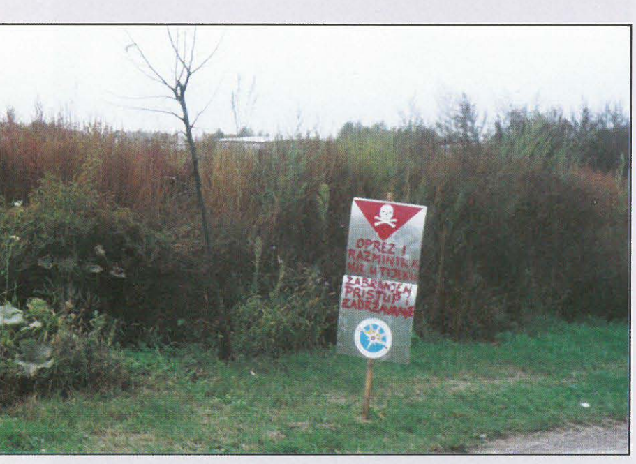
A sign showing that this area is being demined.