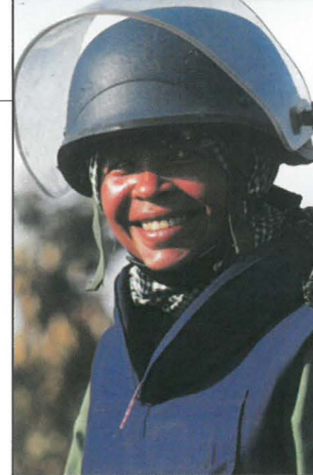
MAG's work provides benefits to its staff and the local community in addition to the removal of mines and UXO from their land. The wages that the staff earn working for MAG will usually go to support an extended family. This money promotes the economic efforts of the broader community.