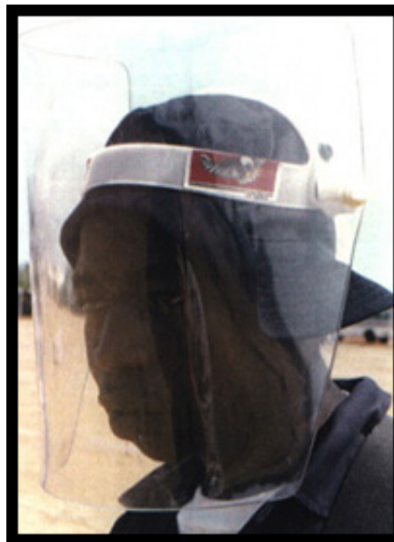
Figure 3: A UN deminer in Angola wearing an LBA visor