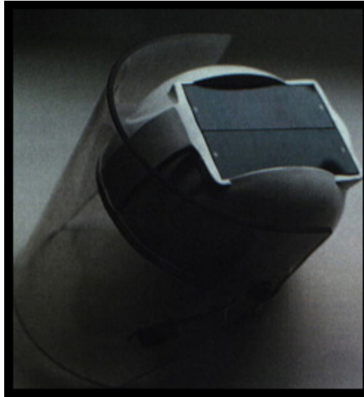
Figure 4: SDL visor with helmet and fan