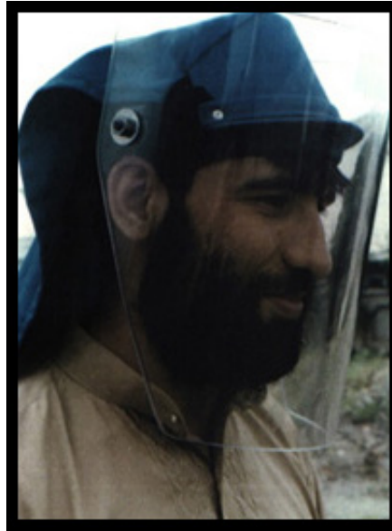
Figure 2: An Afghan deminer (ATC) with an SDL visor

Cheap, robust and reliable solar battery chargers might make such an option viable.